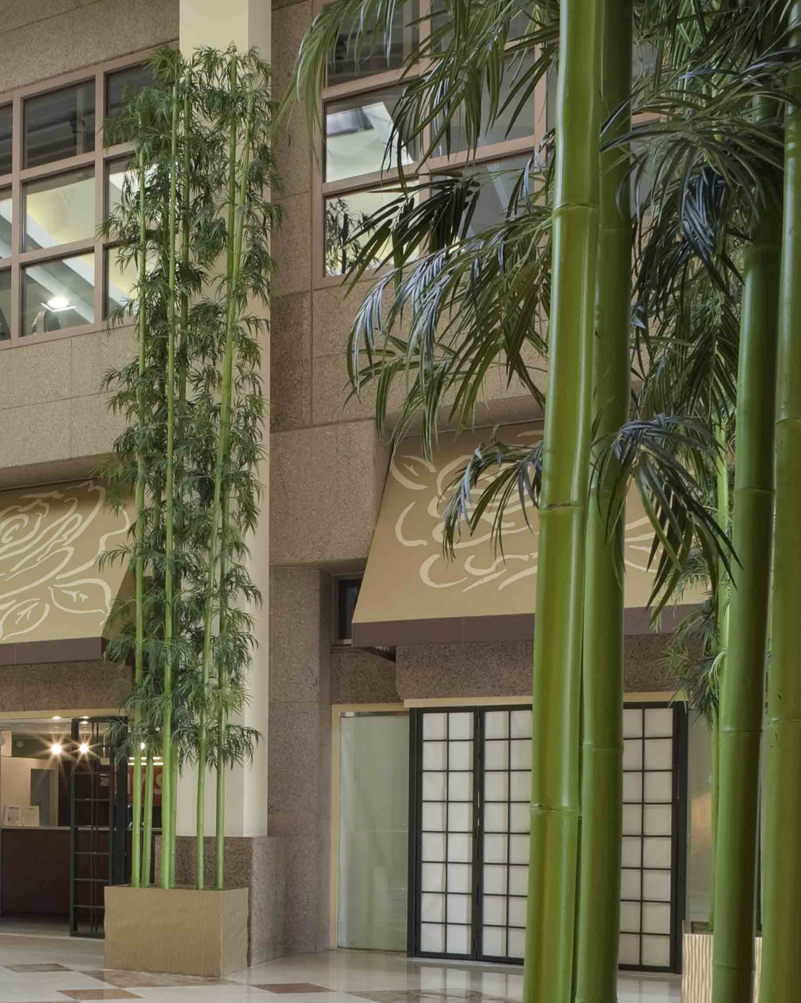
ng Bamboo for Hotel and Event Venue