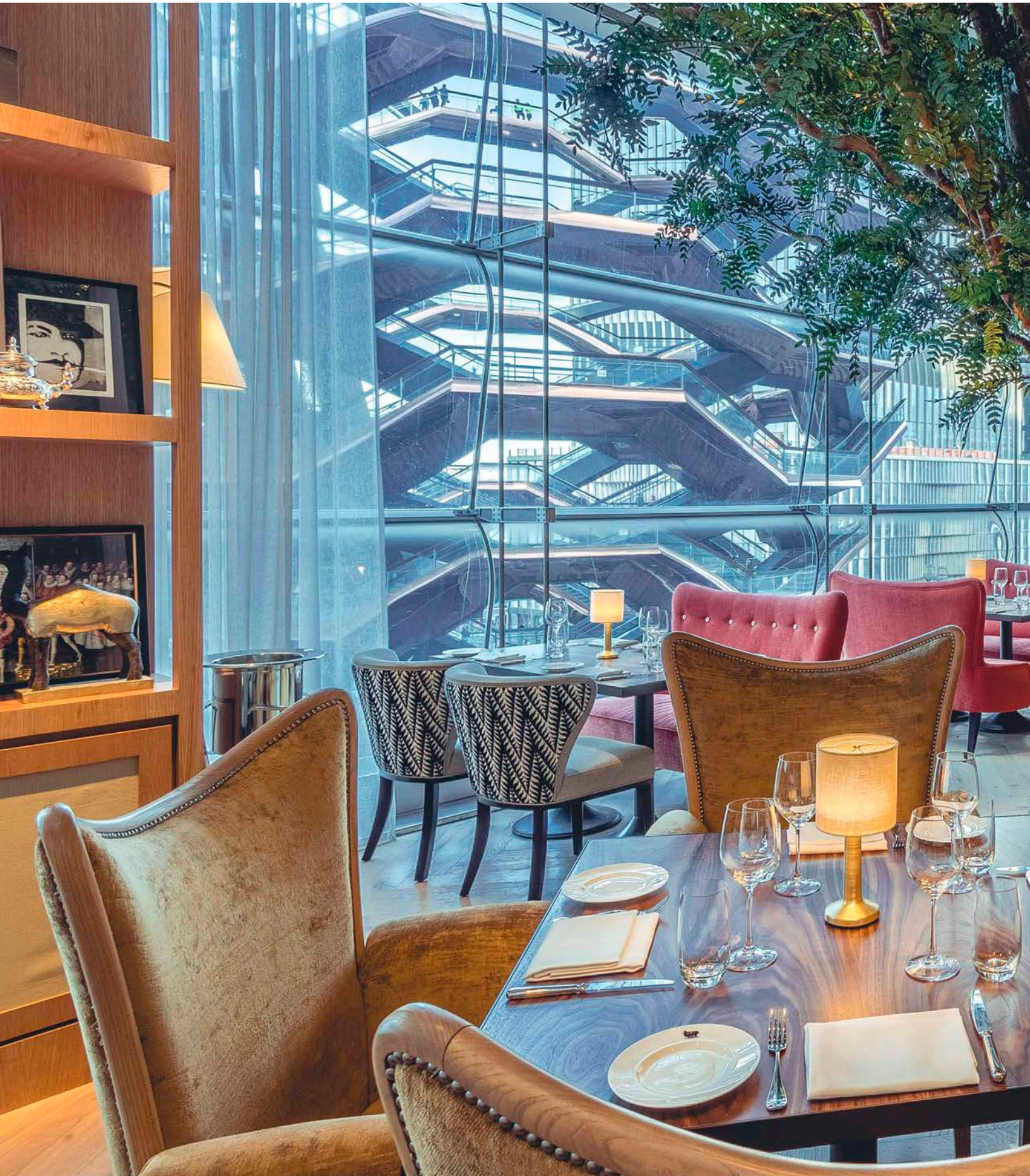
Acacia Trees at New York