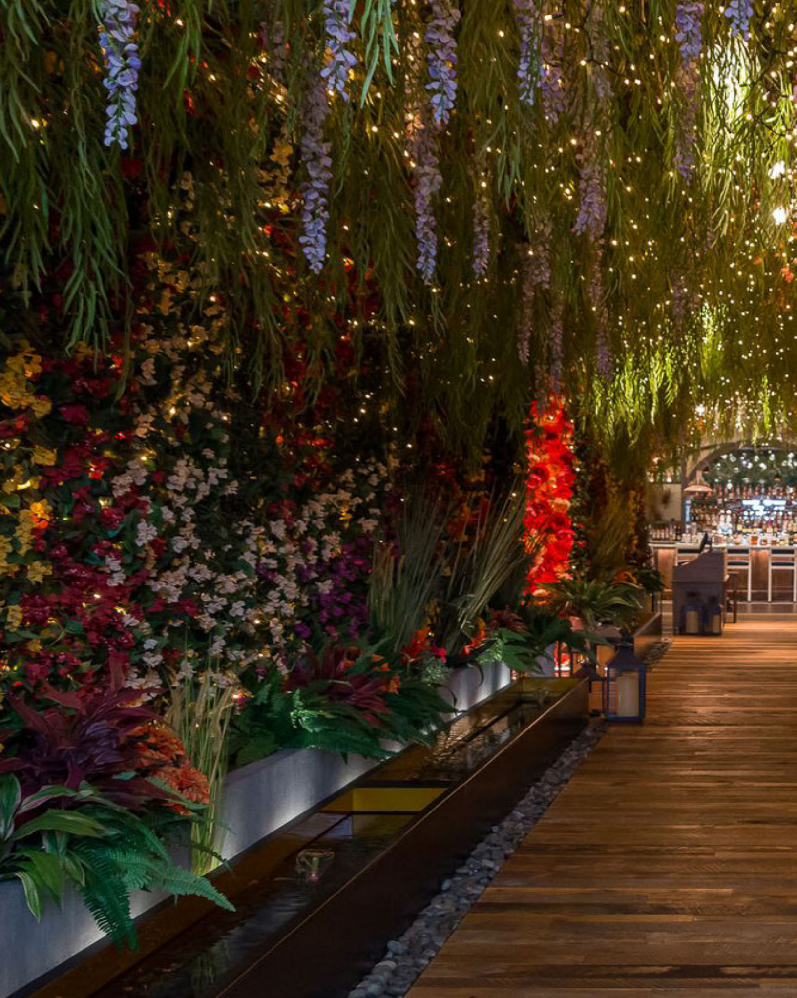
Interior of Floral Wall Pe