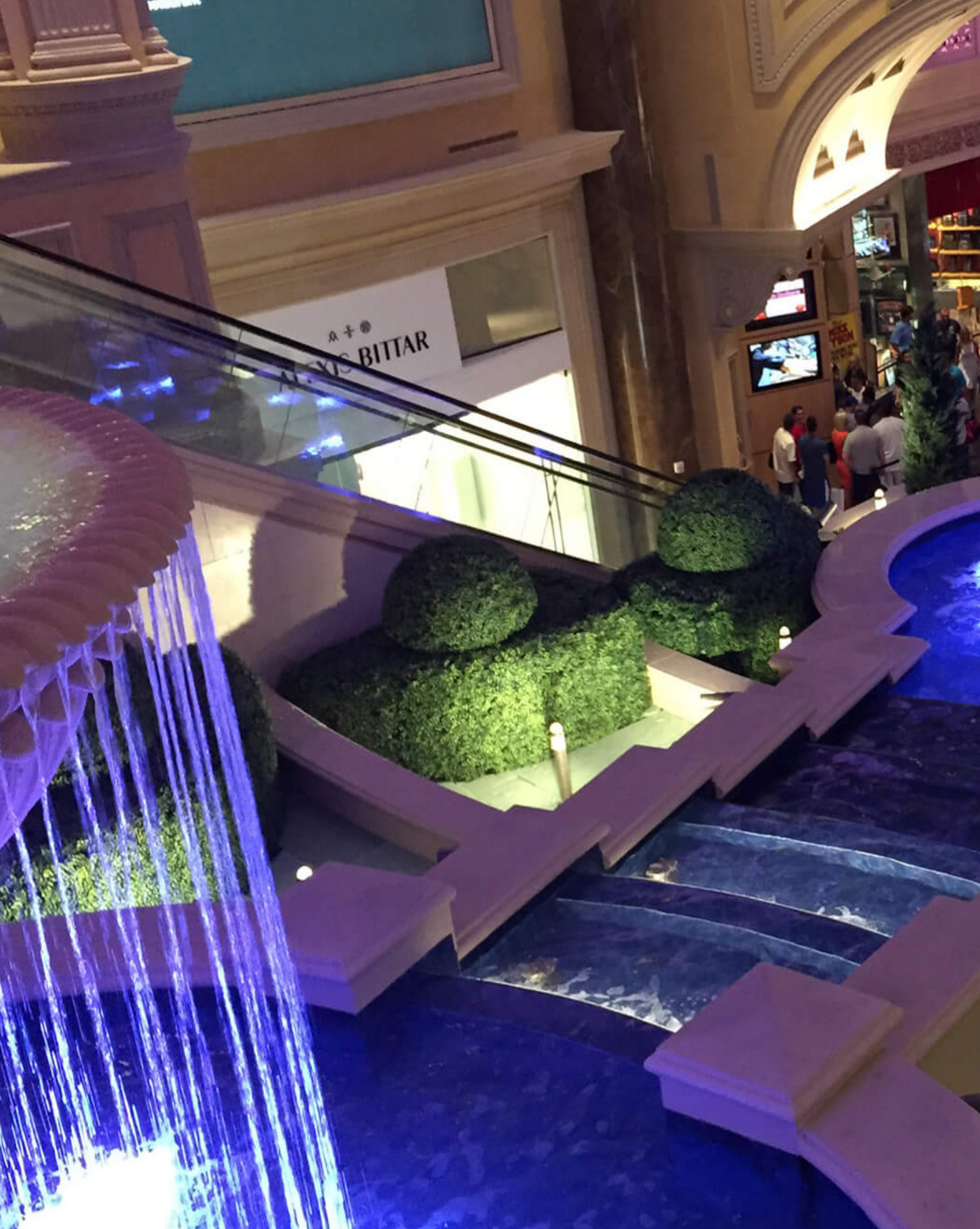
Replica Boxwood Hedges and To