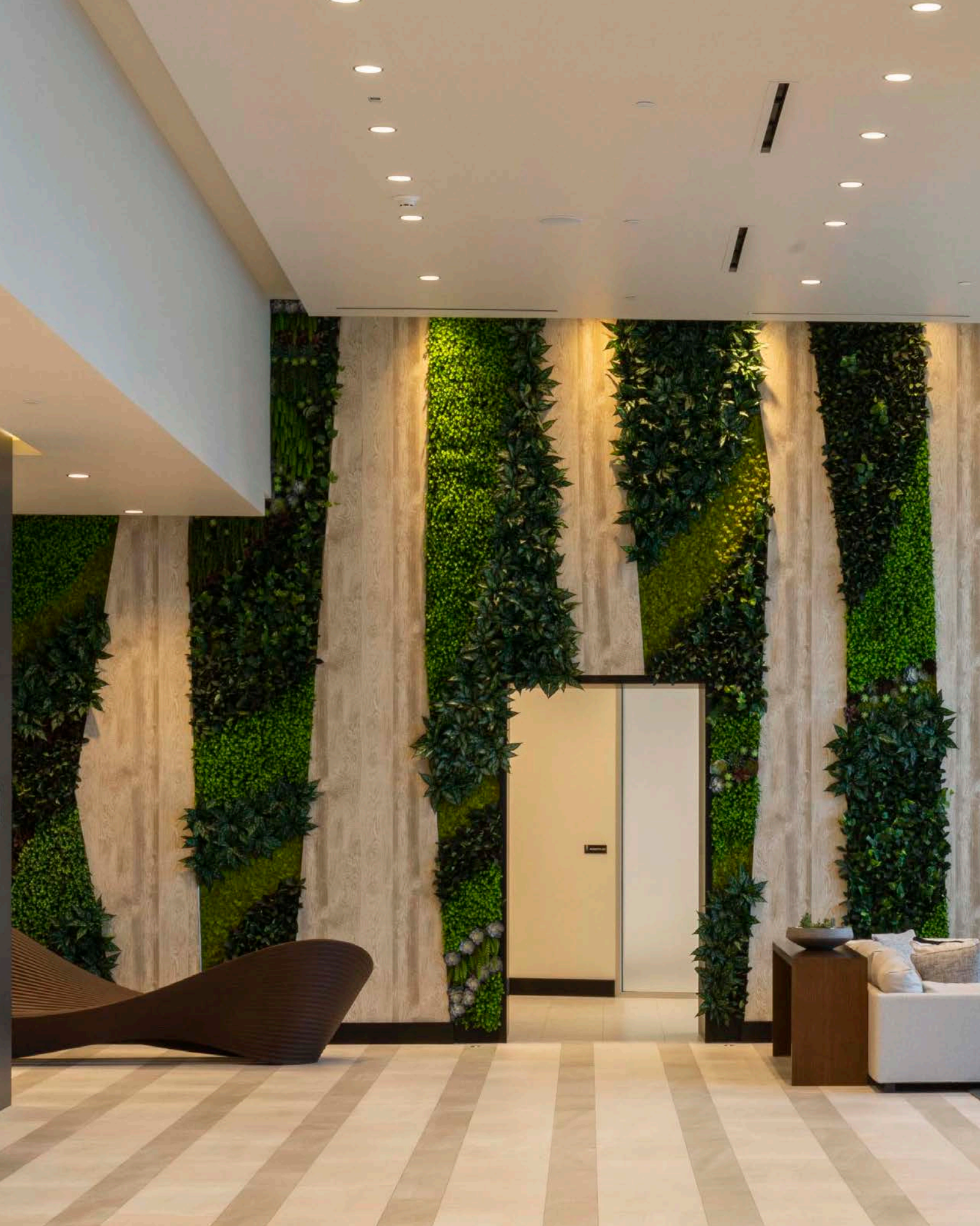
Custom Cherry Blossom Tree and Green Wall for the L