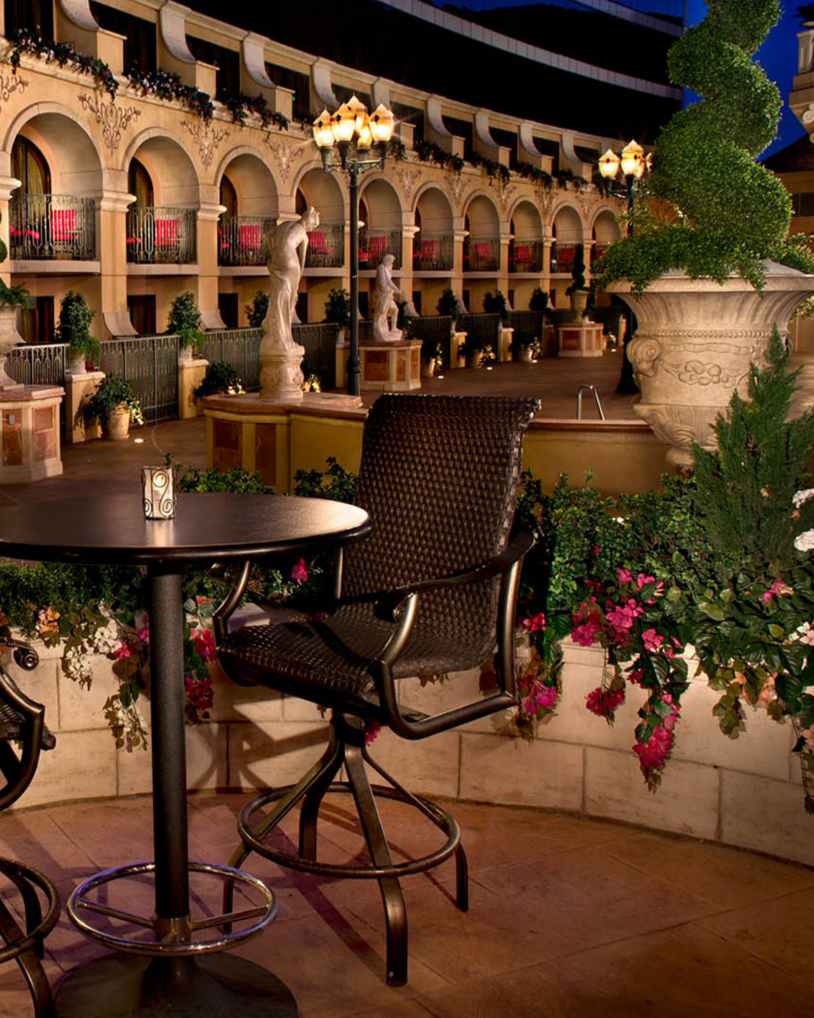
le Florals for Peppermill Casino