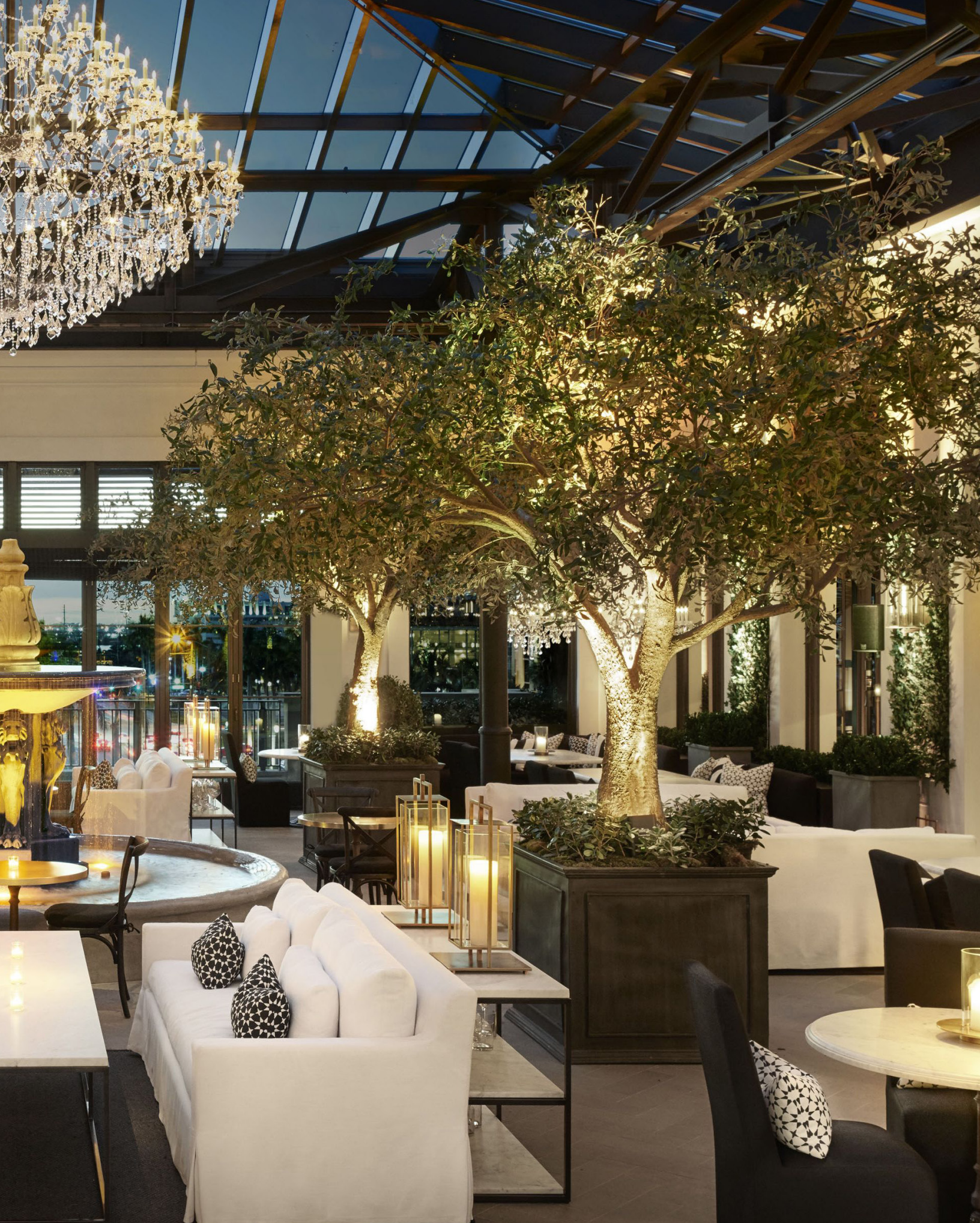
Hedges at the RH West Palm Beach Rooftop Restaurant