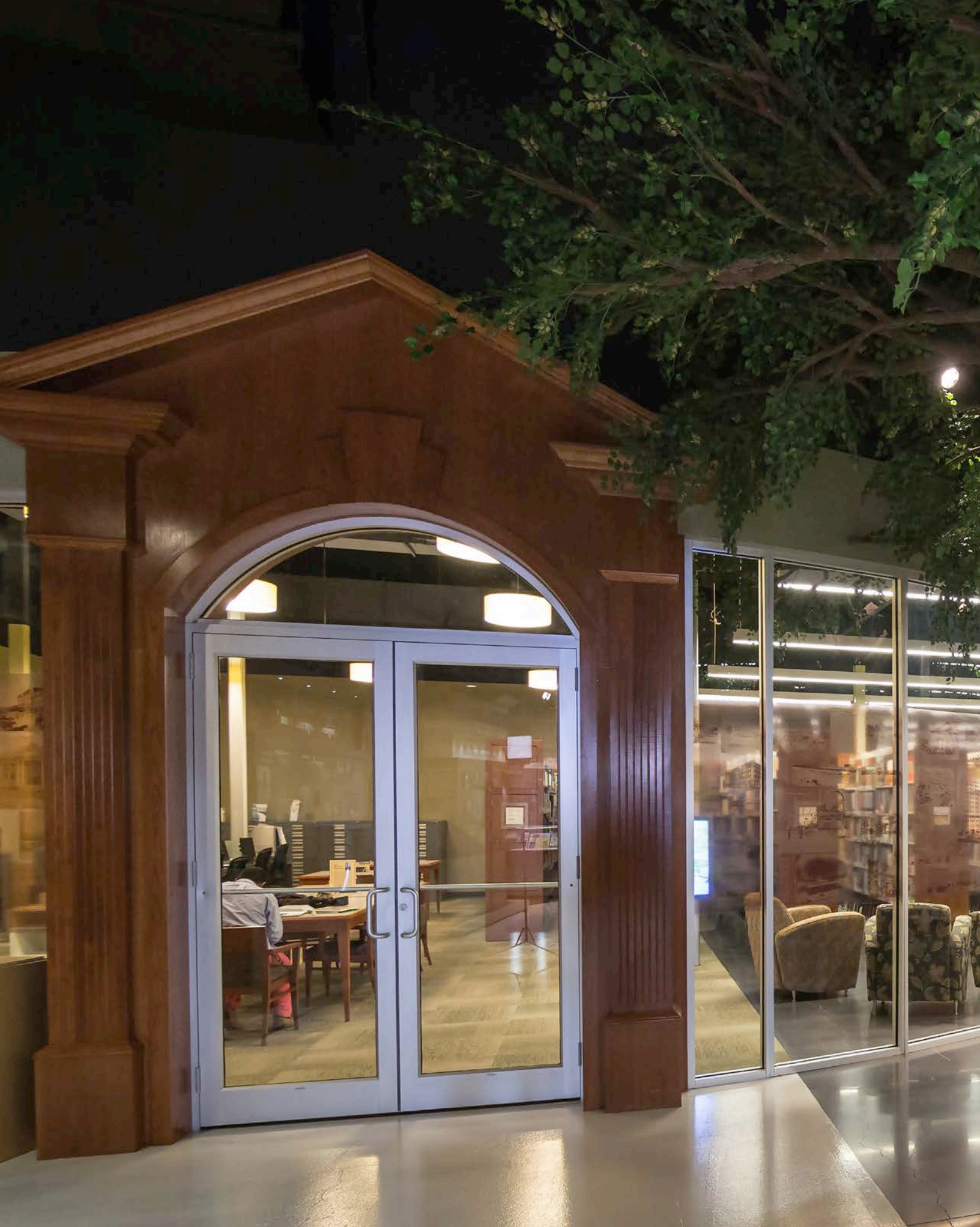
Black Oak Column Con