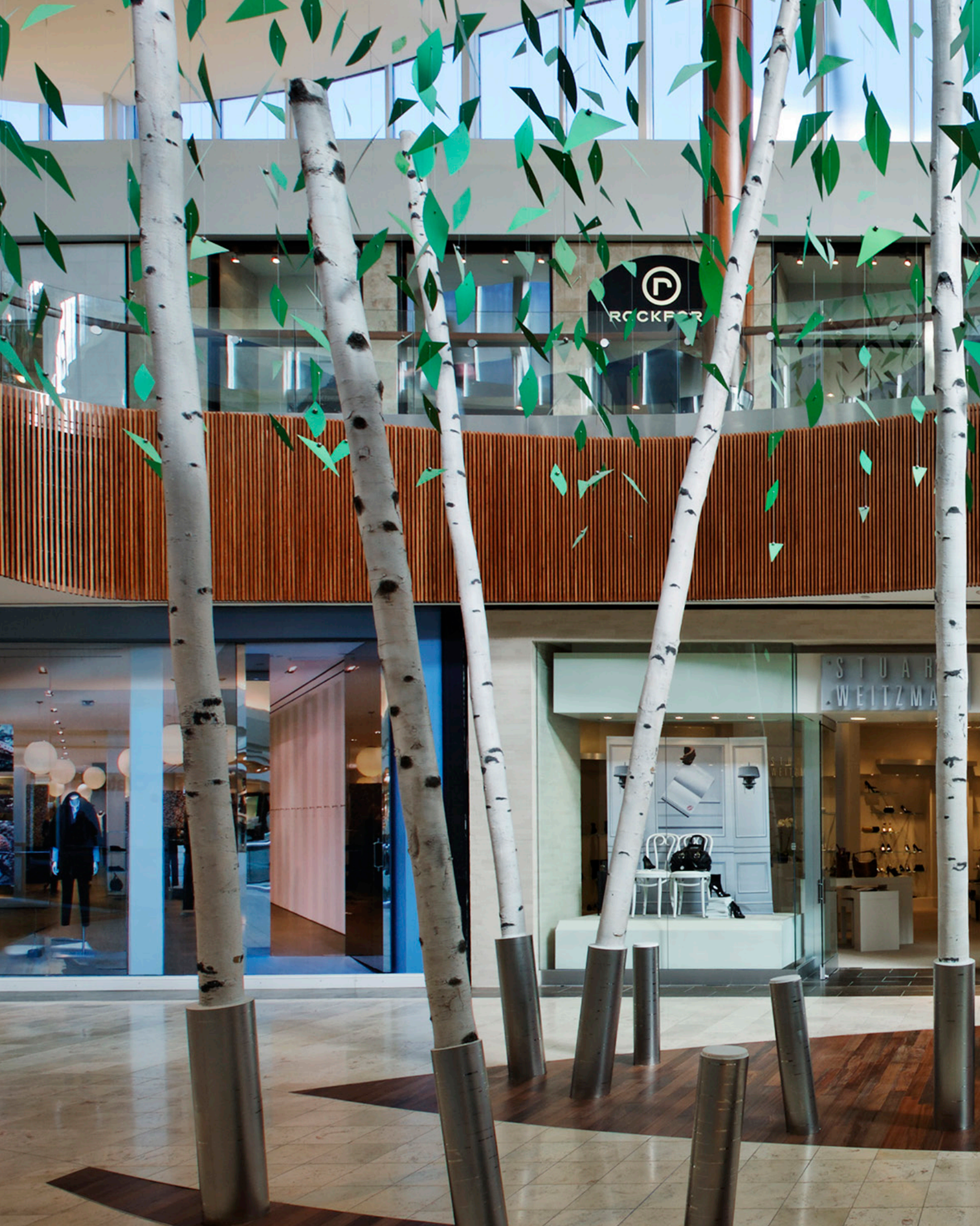
Fabricated Birch Tree Trunks and Original