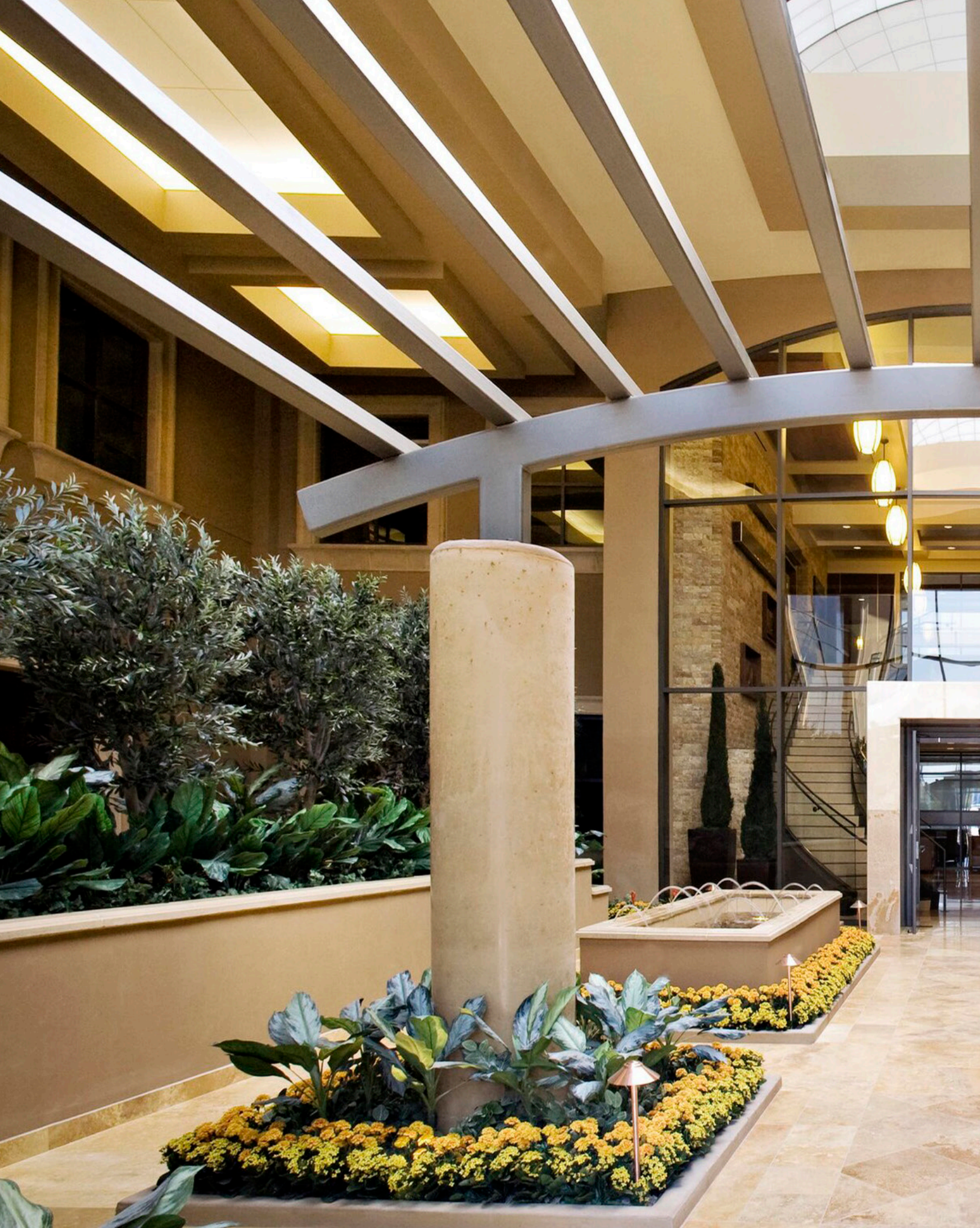
Interior Landscaping for Tu