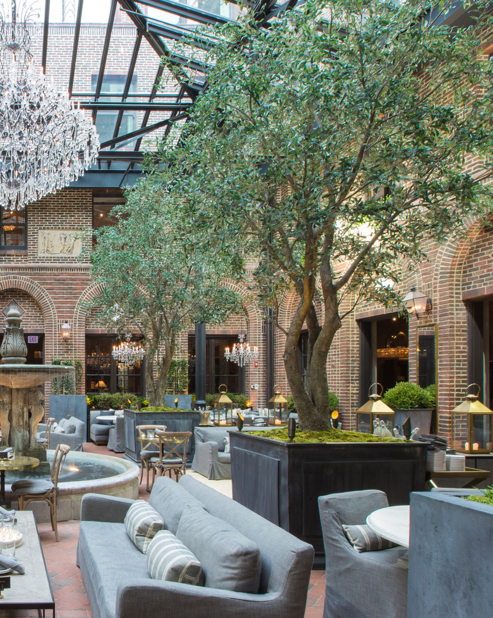
at RH Chicago 3 Arts Club Cafe