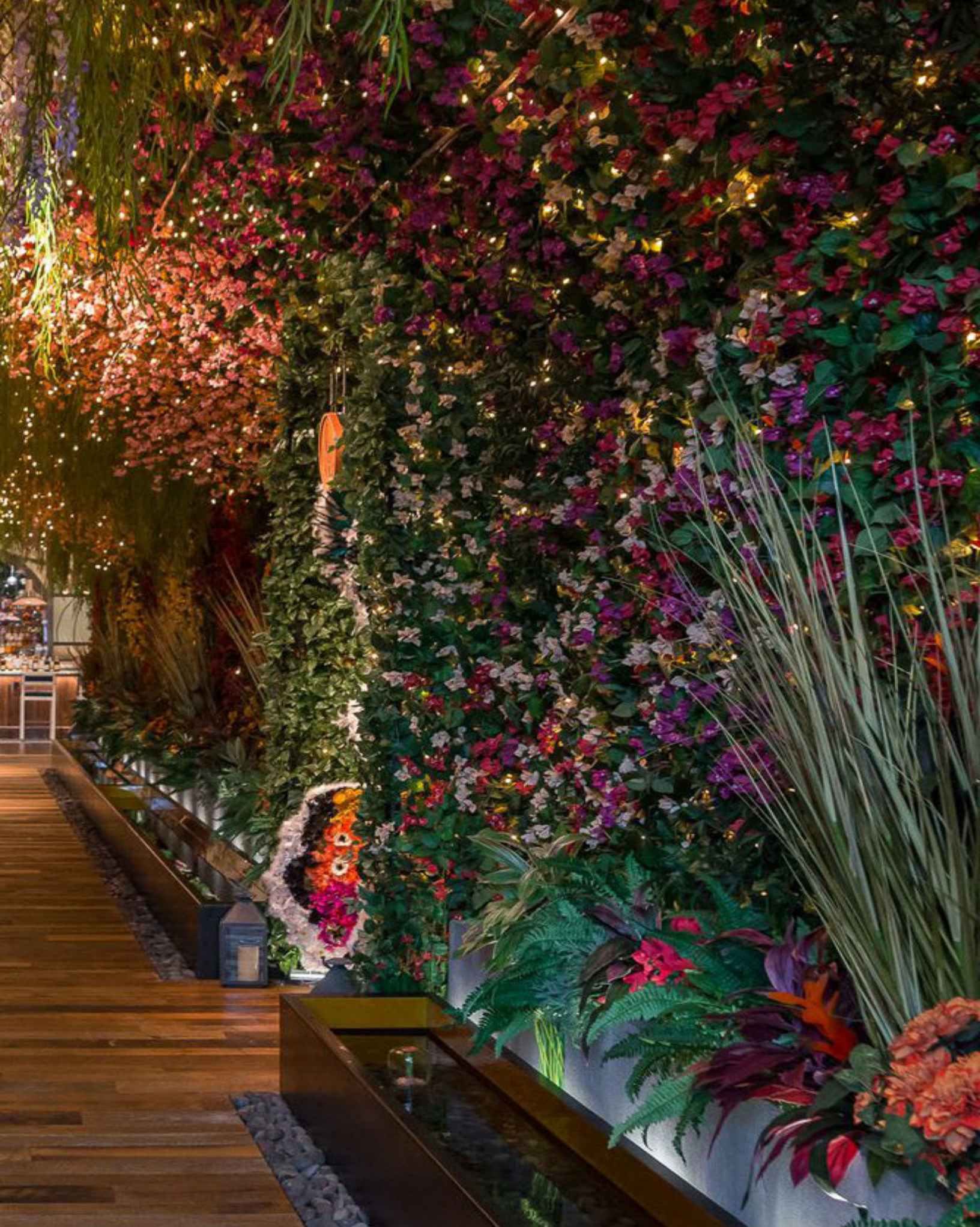
argola at CATCH Restaurant