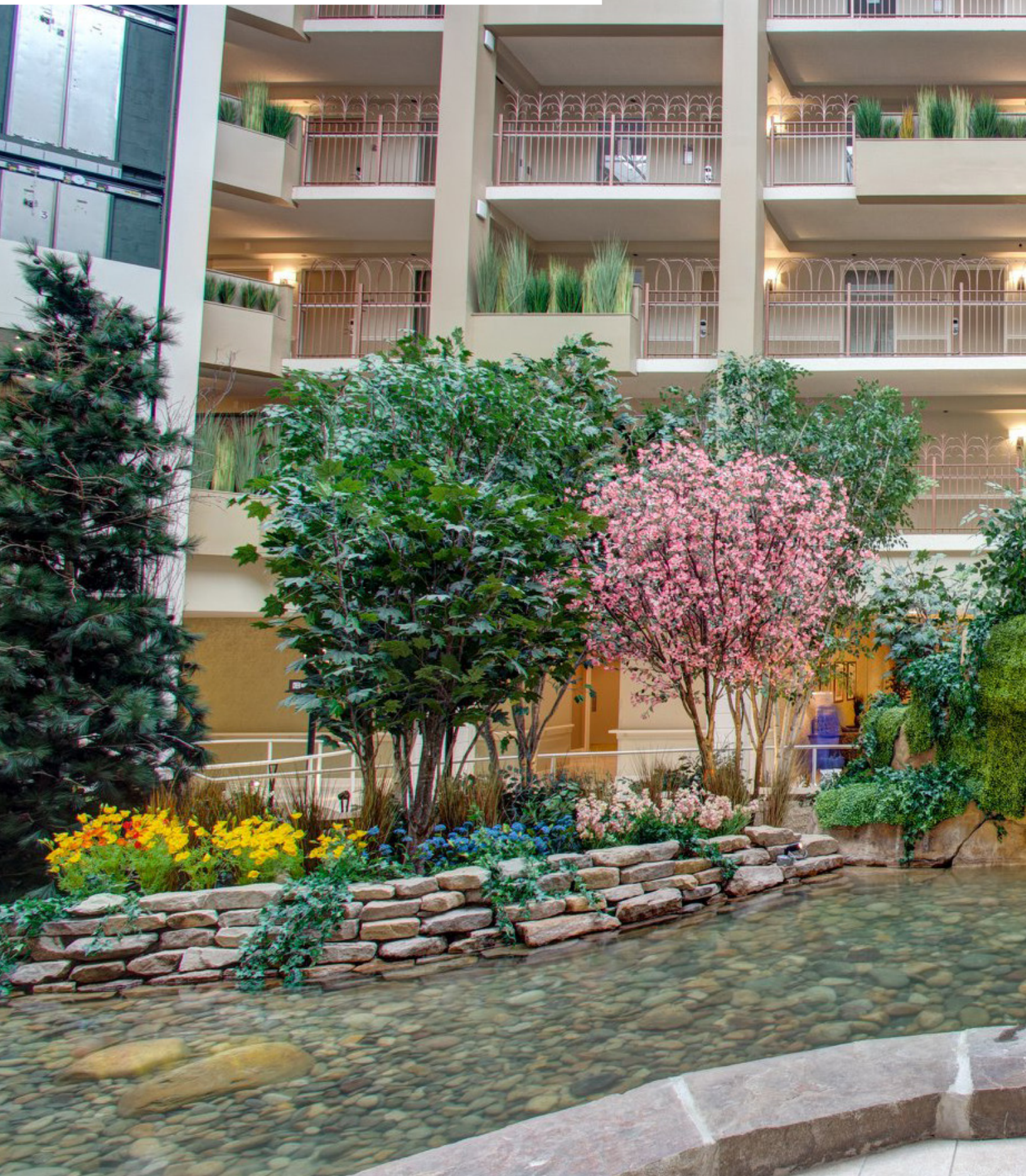
Faux Landscaping for S