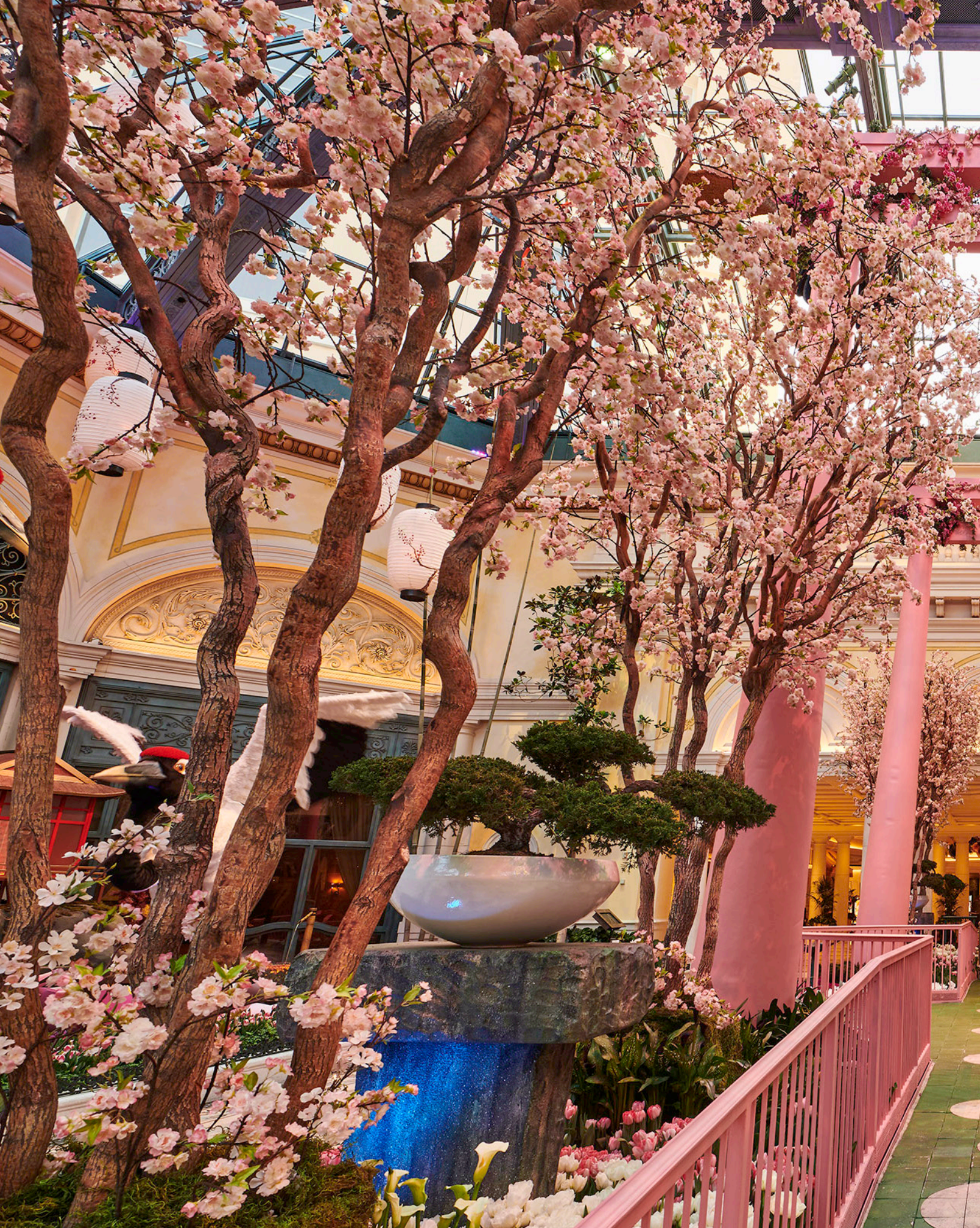
Replica Cherry Blossom Tr