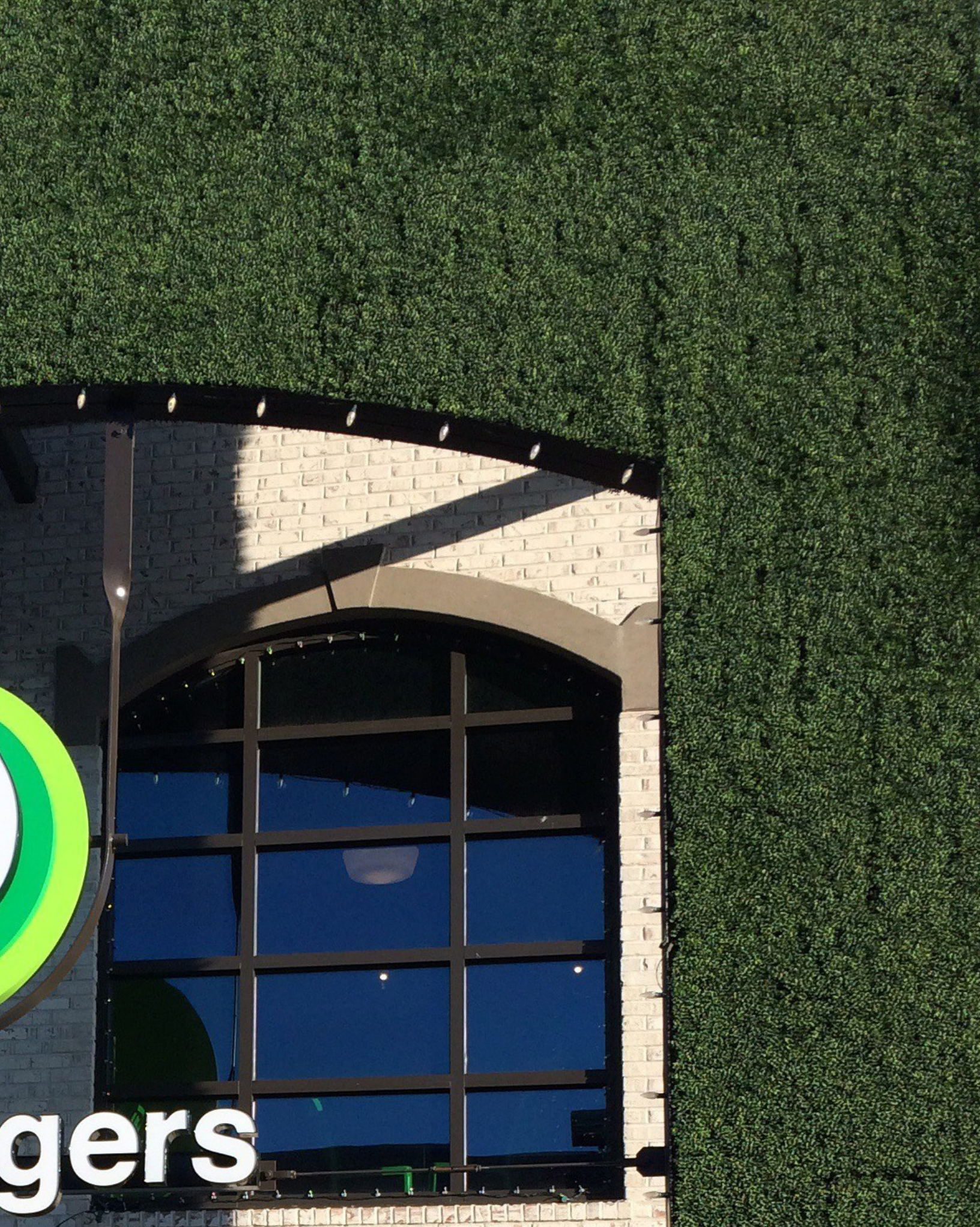
Green Wall for Restaurant Chain