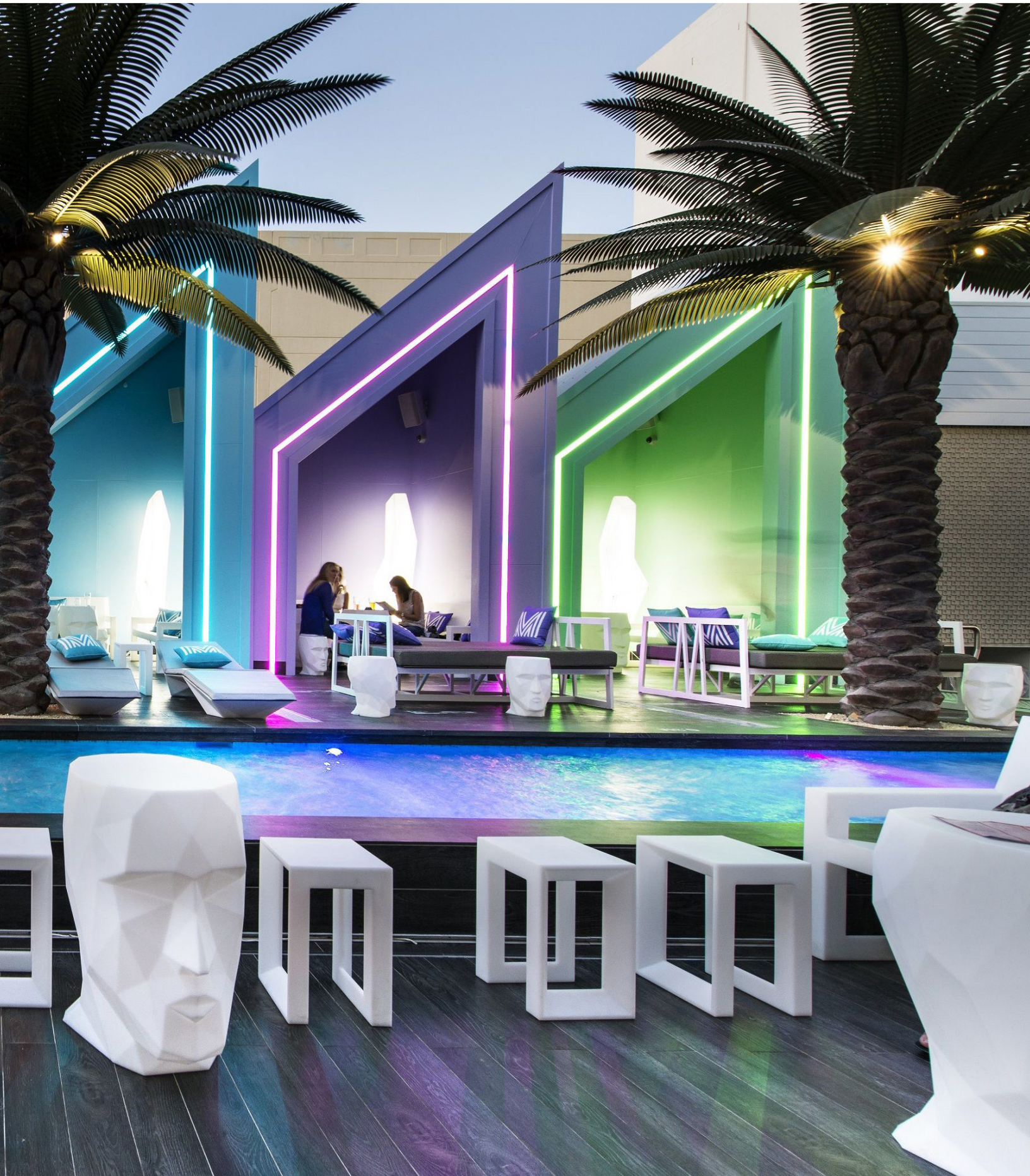
Dactylifera Palm Trees at Australian Beach Club