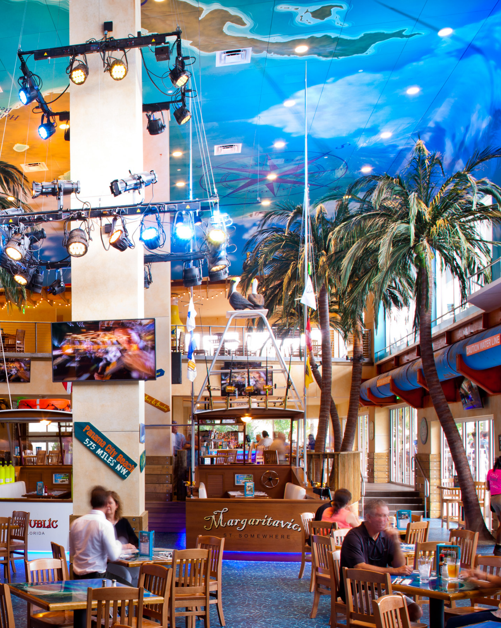
Margaritaville Resort and Restaurant