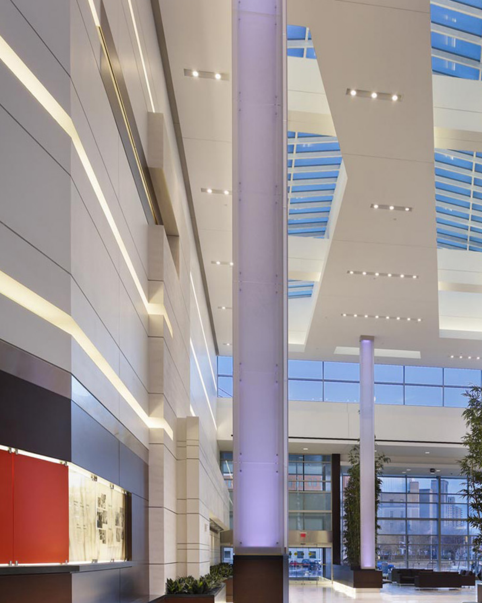
Natural Golden Cane 40-Foot Tall Bamboo with Fabricat