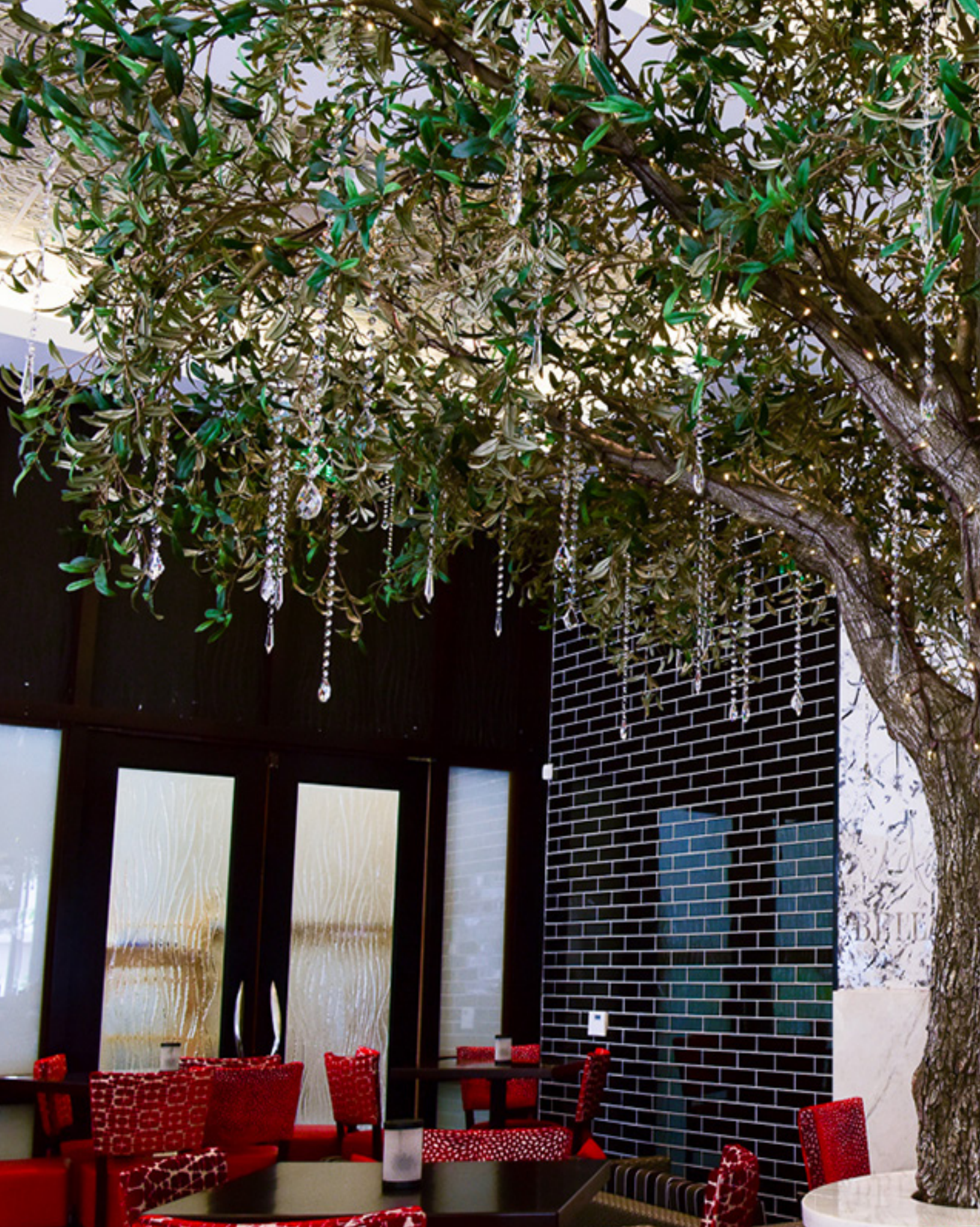
Olive Column Concealment