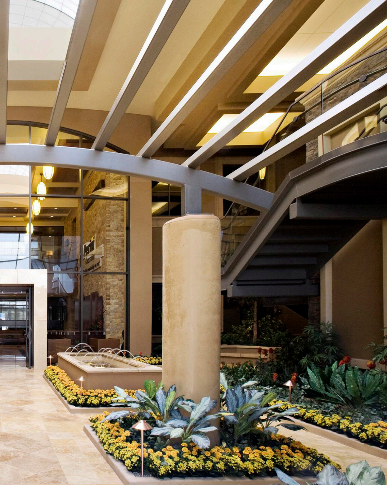
tor Perini Corporation Offices