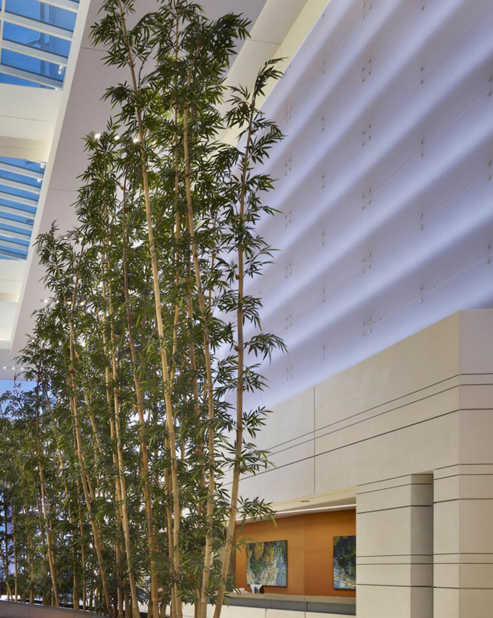
ed Oriental Foliage, for a Hospital's Patient Pavilion Lobby