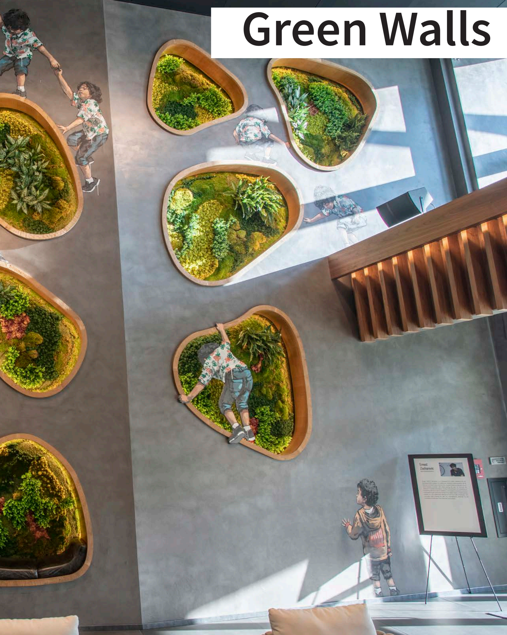
Vertical Green Wall for IPIC Movie Theater