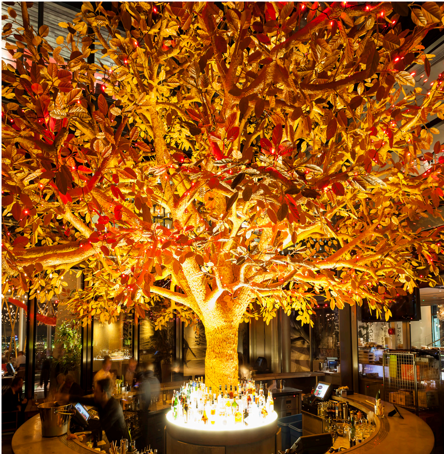
Custom Tree at Sushisamba's London Heron Tower Restaurant