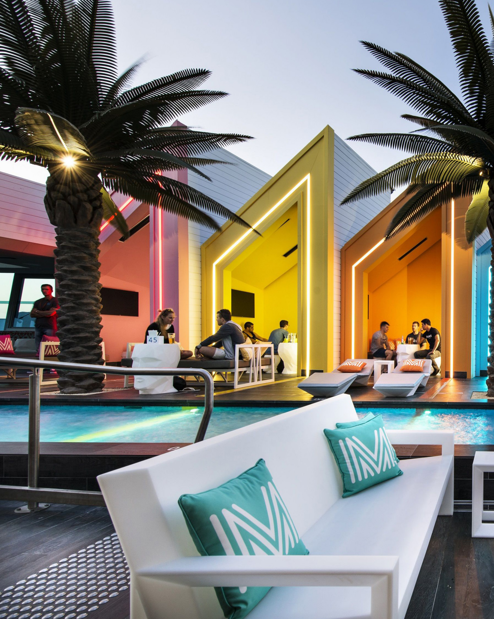
Ultraviolet Inhibited (UVI) Fabricated Phoenix