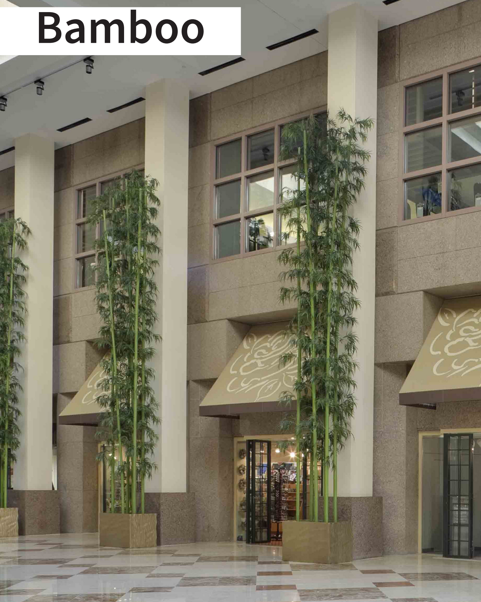
Fabricated 24-Foot Tall Green Weeping