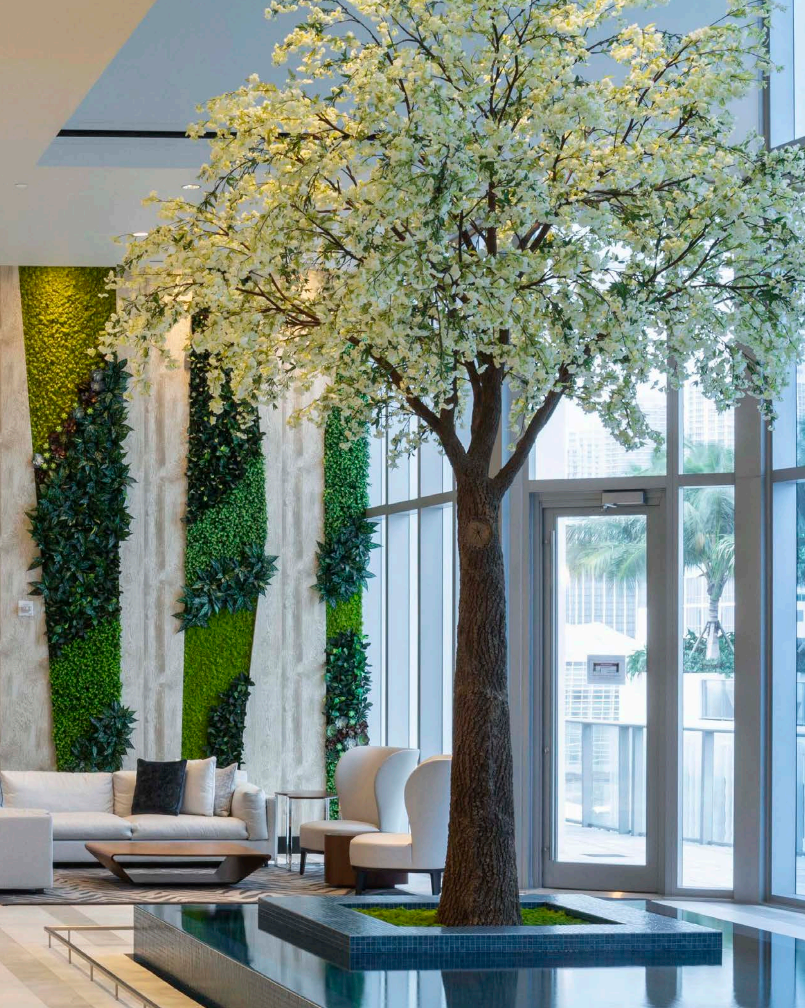
Paramount Miami World Center Resident Conservatory