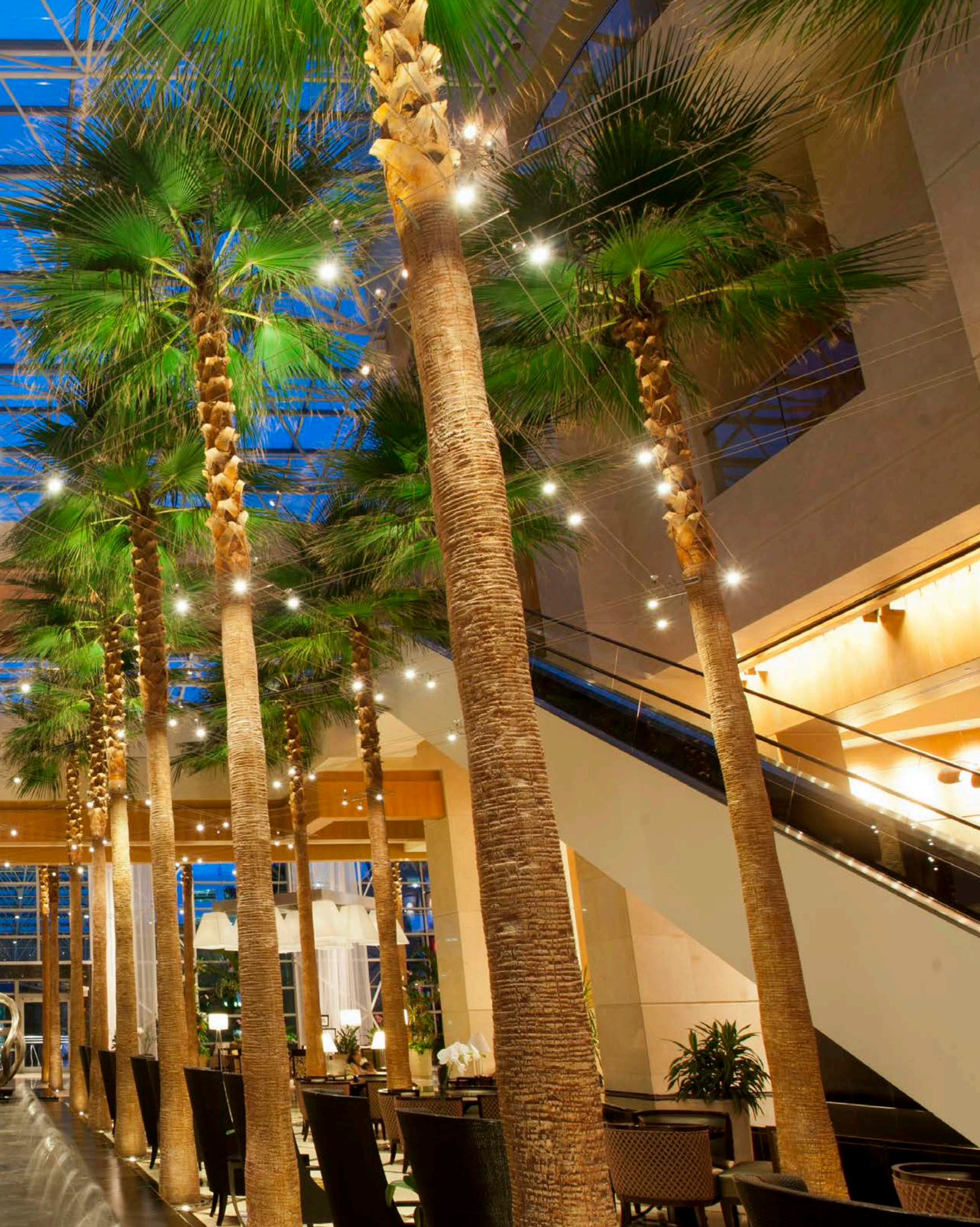
es for a Beach Resort