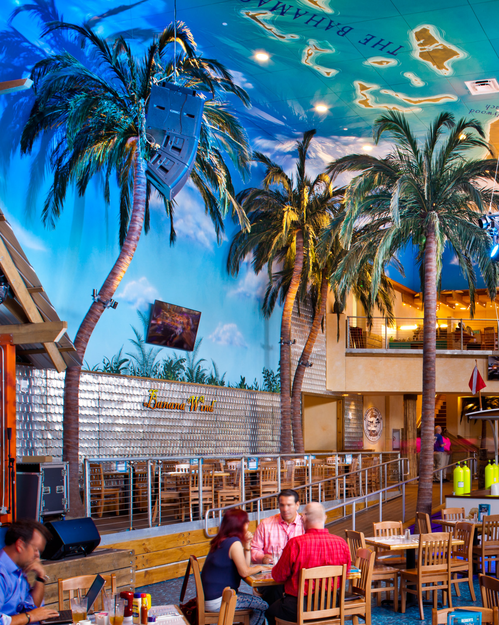
Fabricated Coconut Palm Trees at L