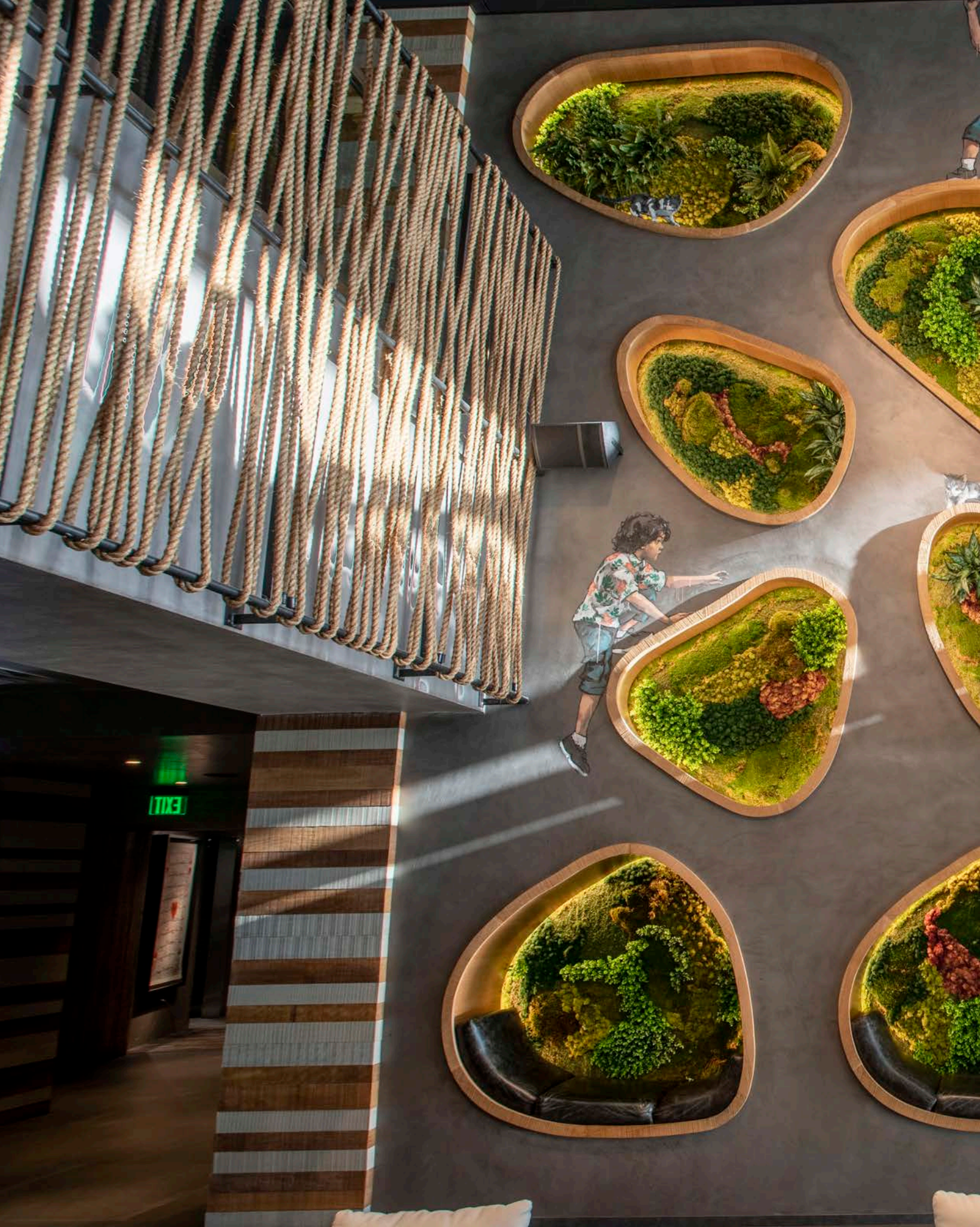
Replica Plant and Preserved Moss Ve