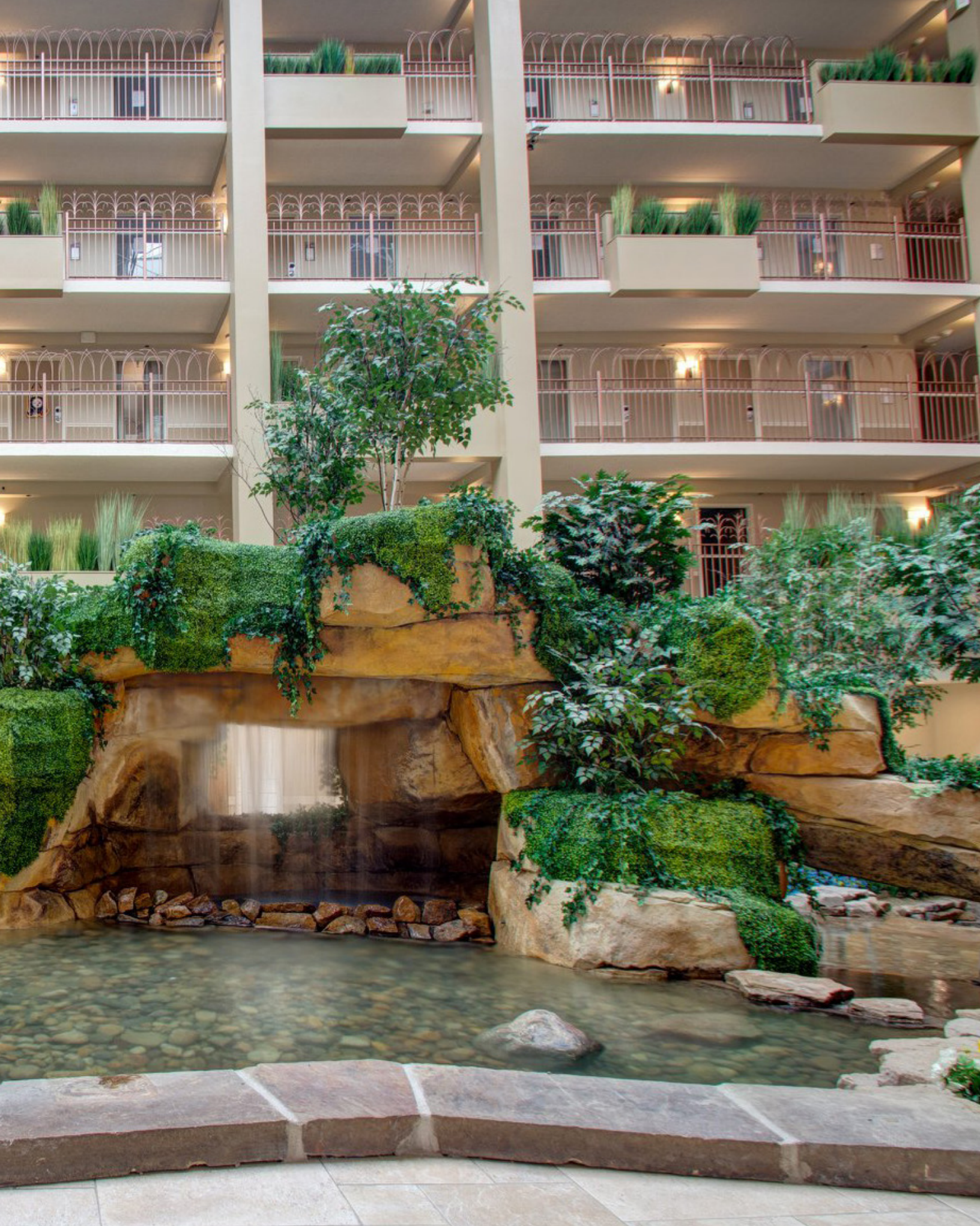
Senior Living Community