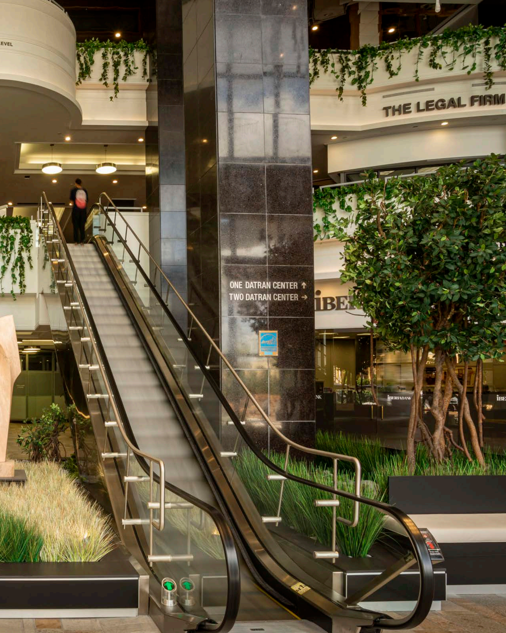
cculents, and Palm Plants for Datran Business Center