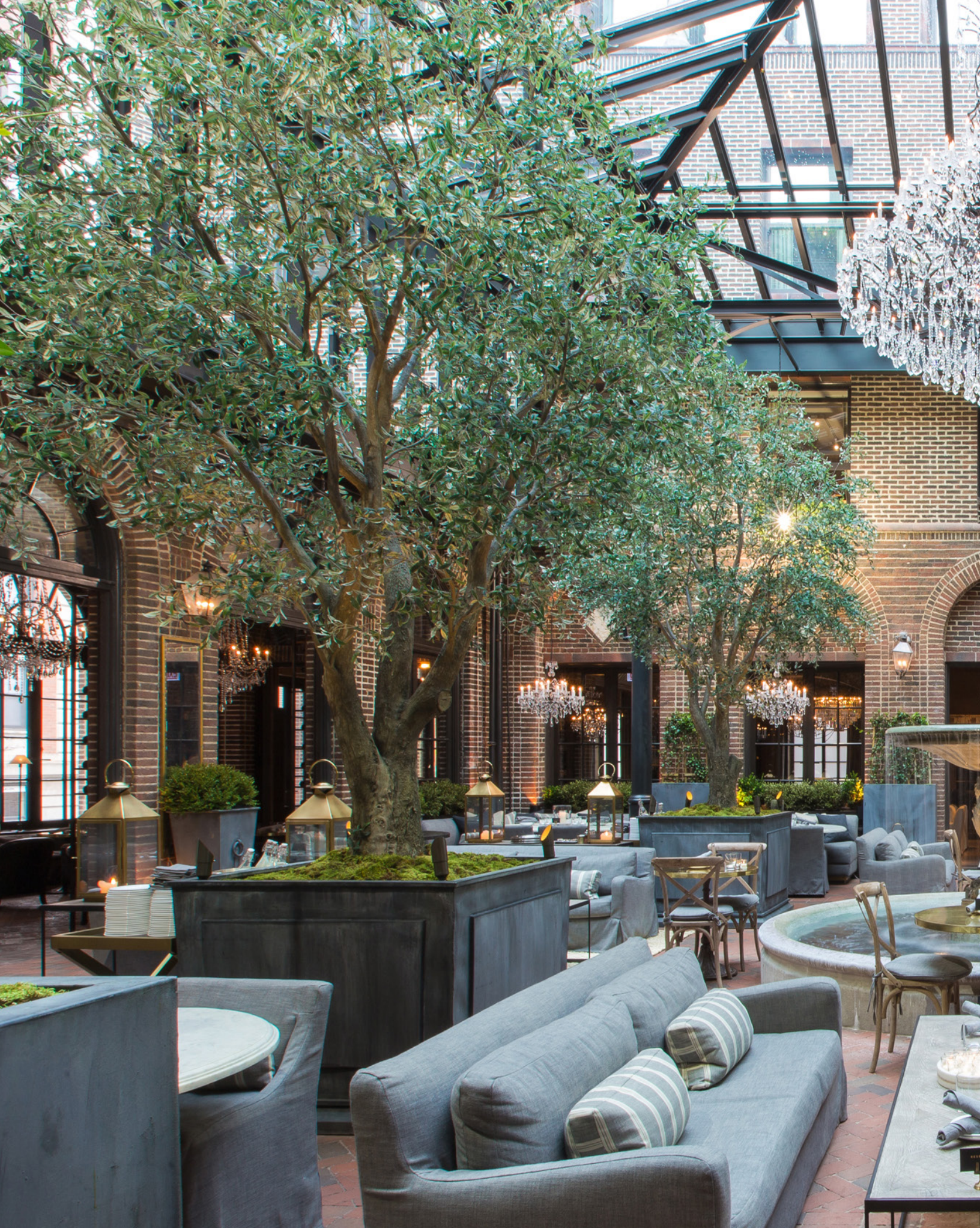
Mediterranean Olive Trees a