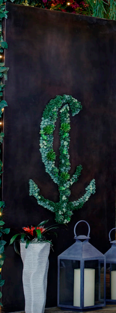
Floral Green Wall Pergola