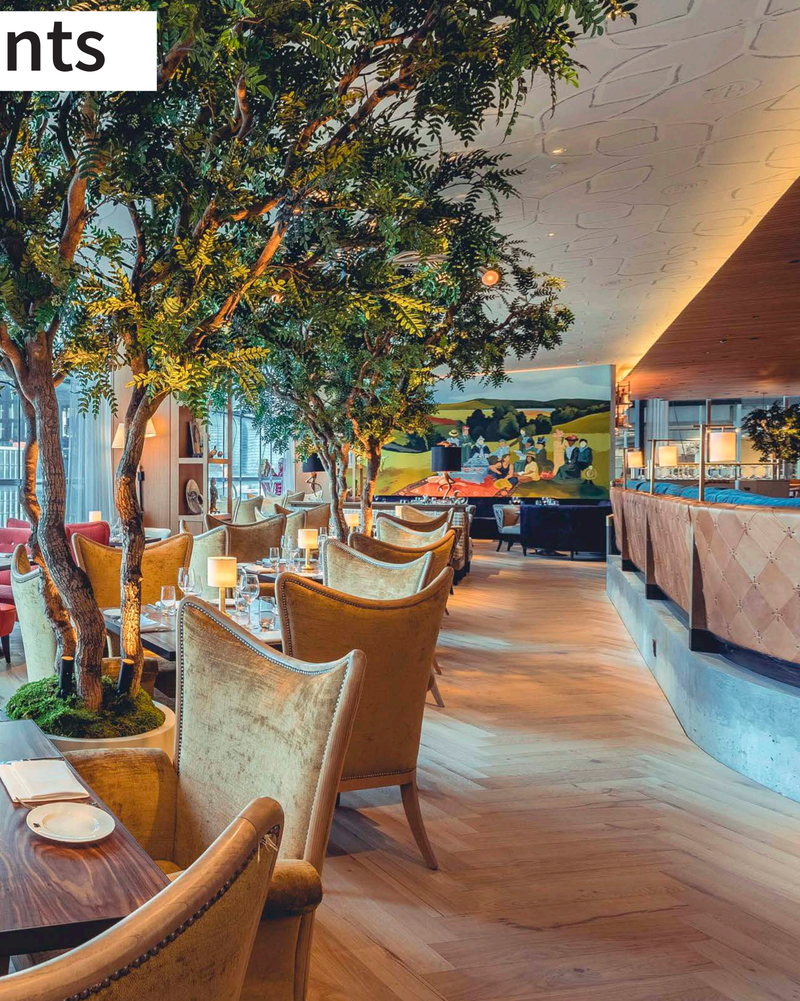
ck's Queensyard Restaurant