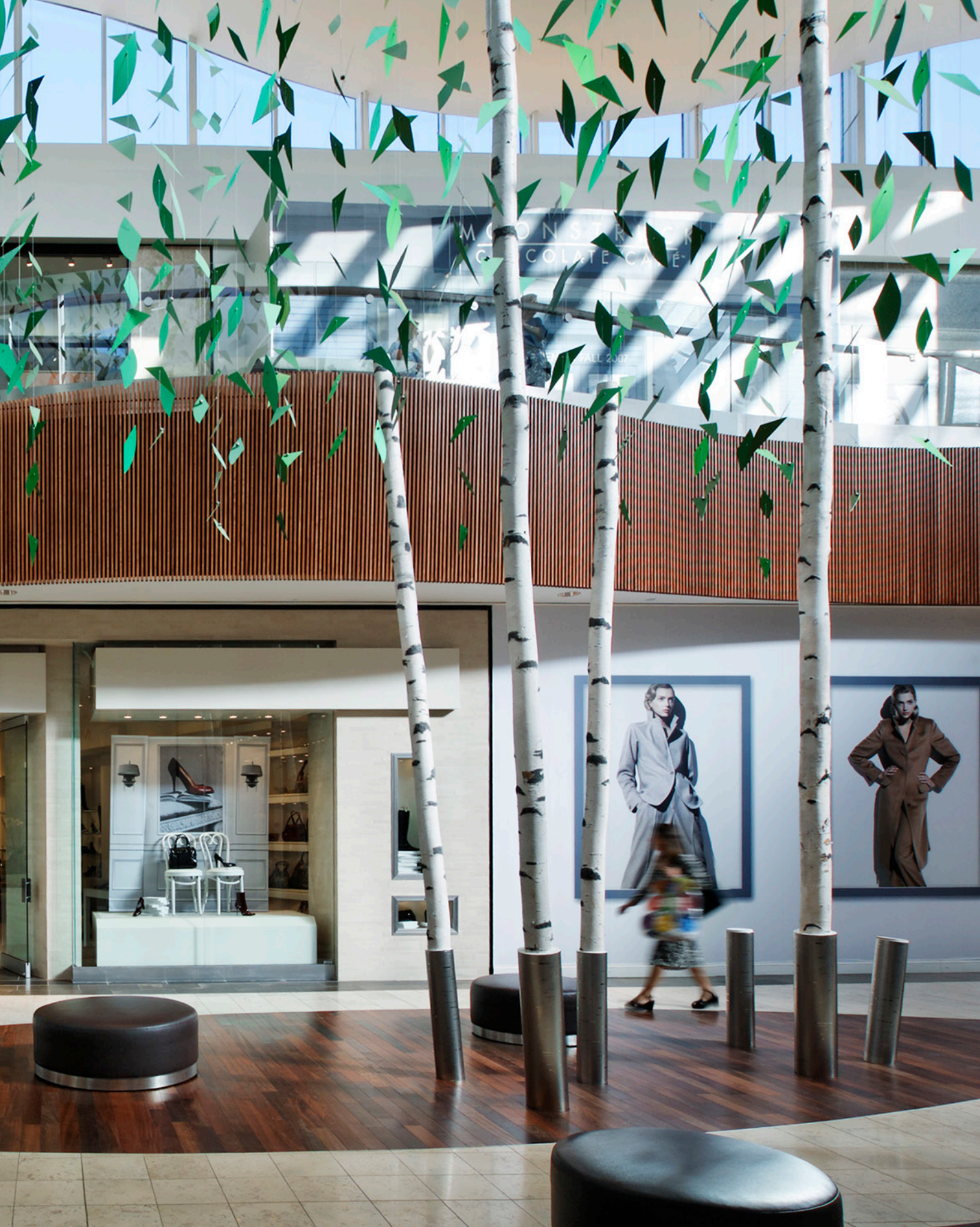
mi Leaves for Shopping Center Art Display