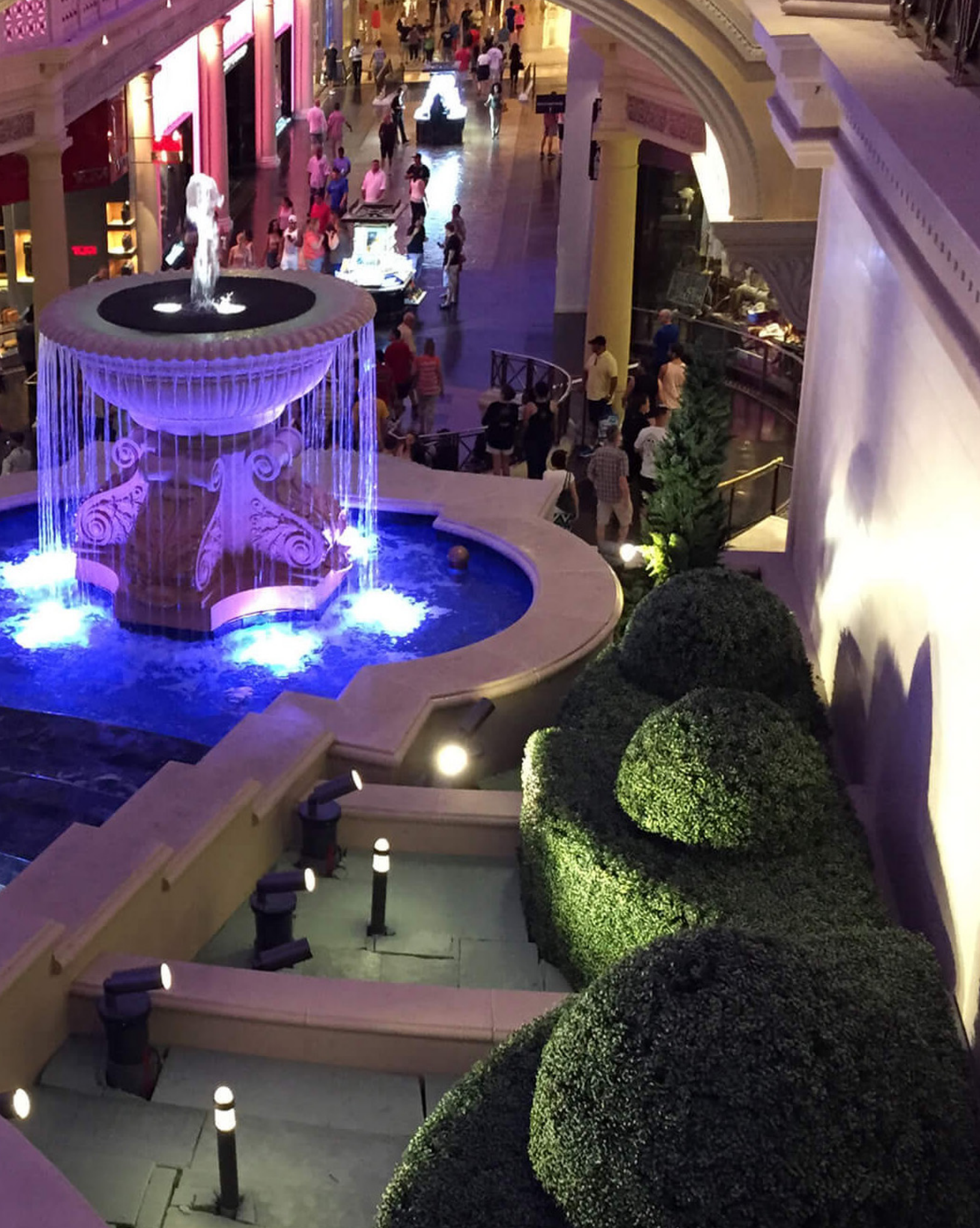
piaries for Casino Shopping Center