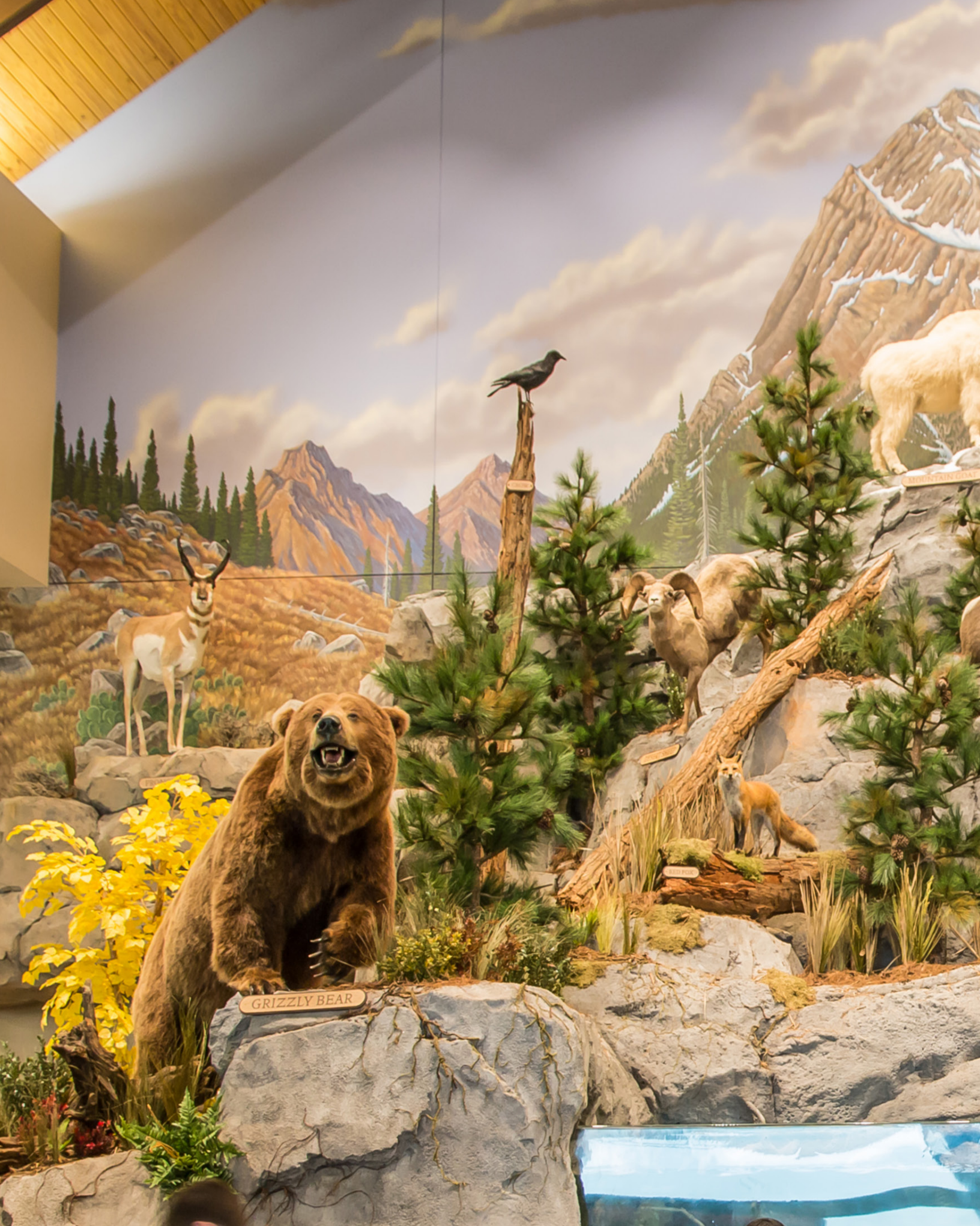
Lifeline Habitat Landscapes for C