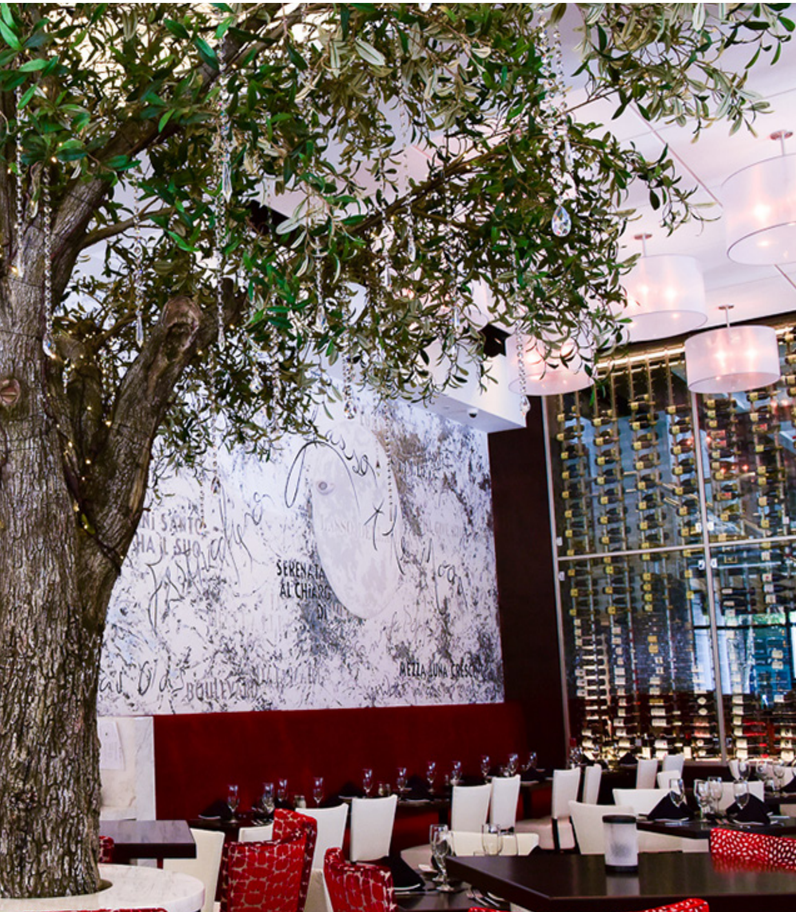
Plant Tree for Italian Restaurant