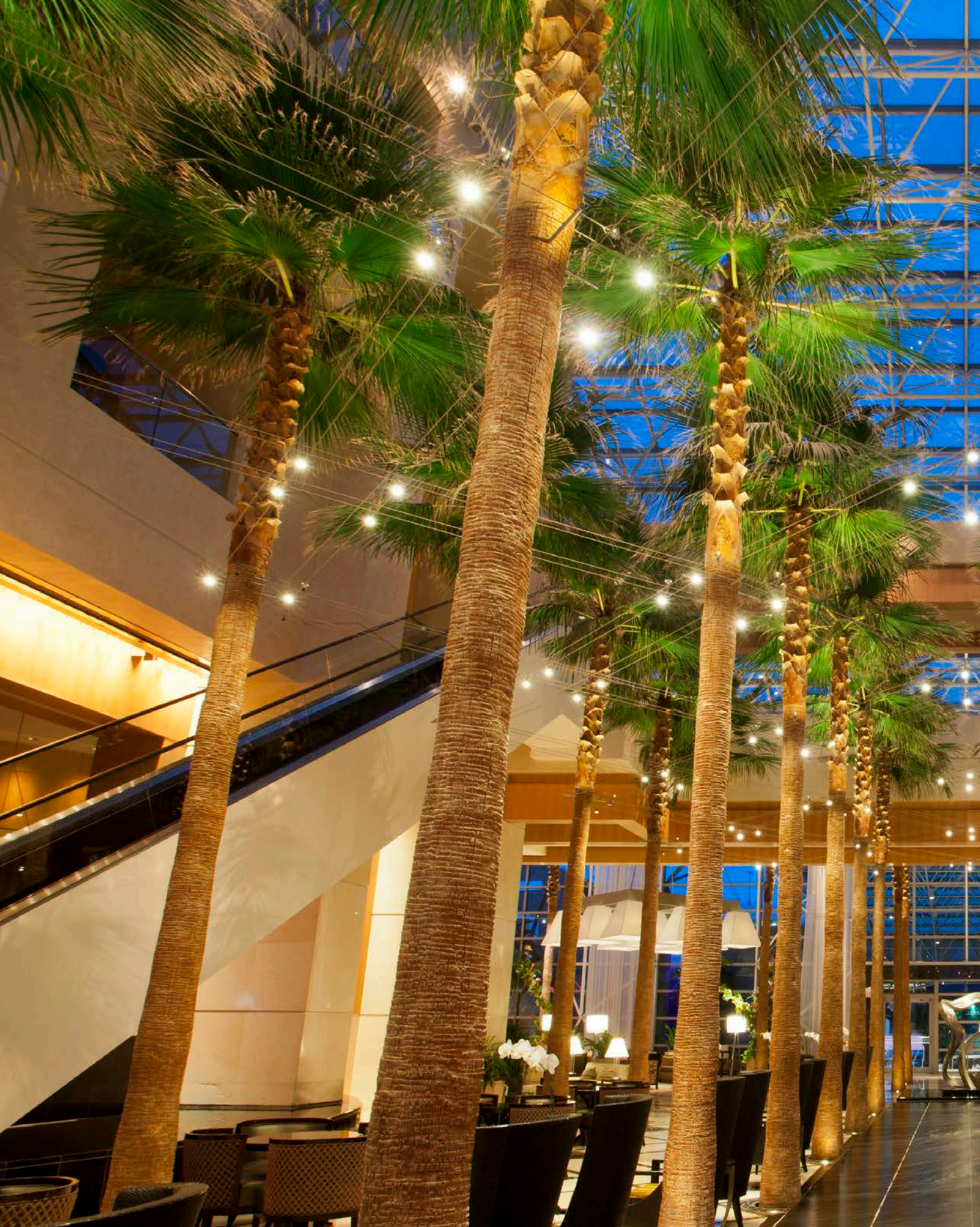
Preserved Palm Tree