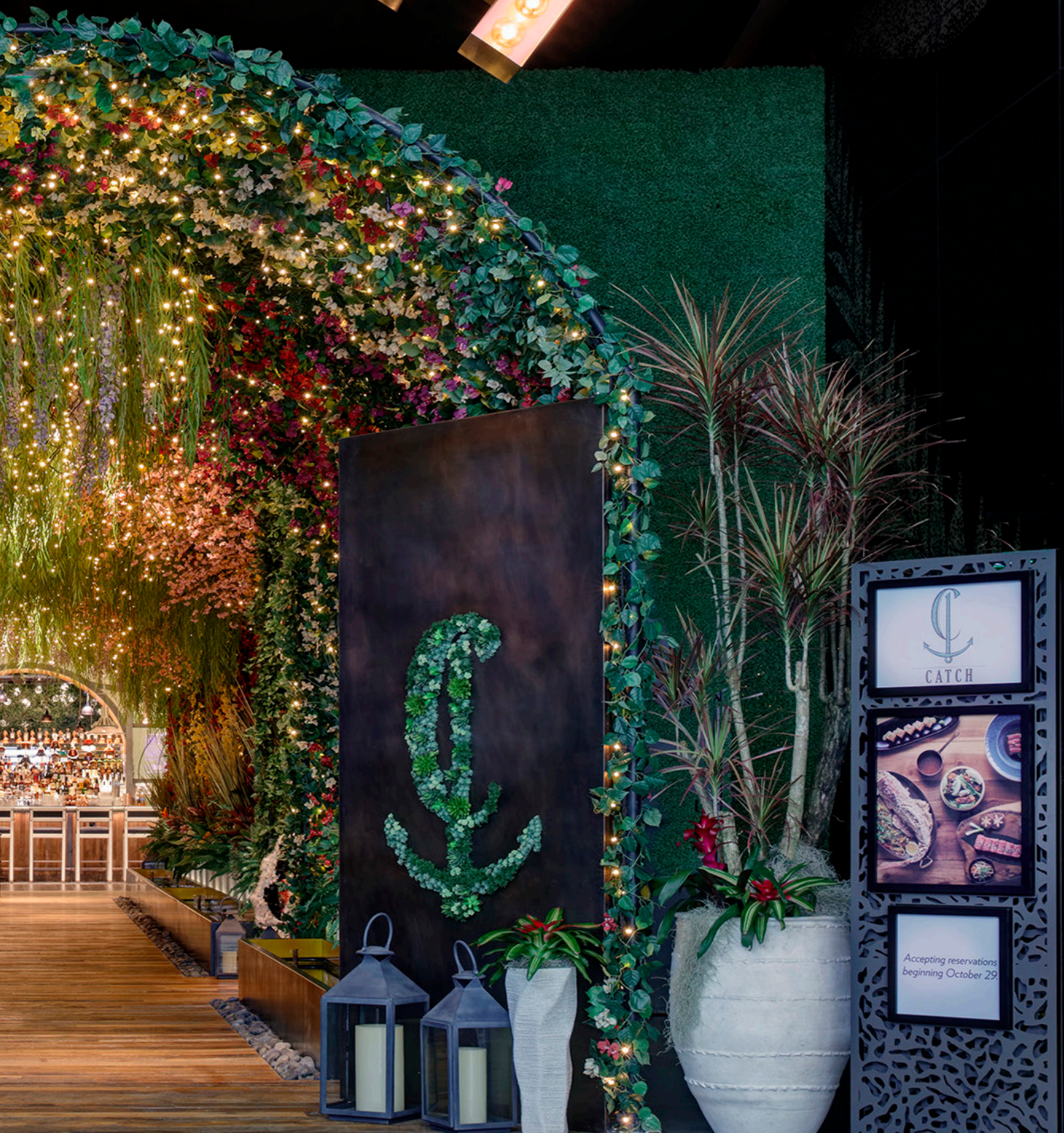
Entry at CATCH Restaurant