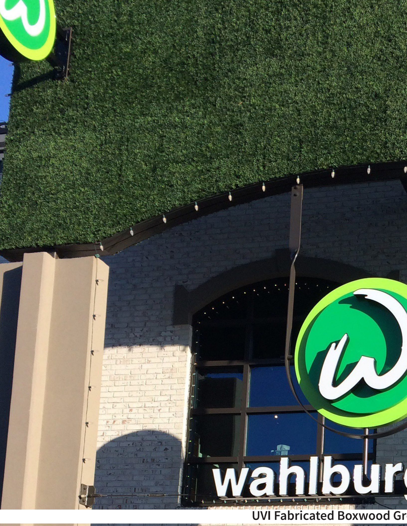
UVI Fabricated Boxwood Gr