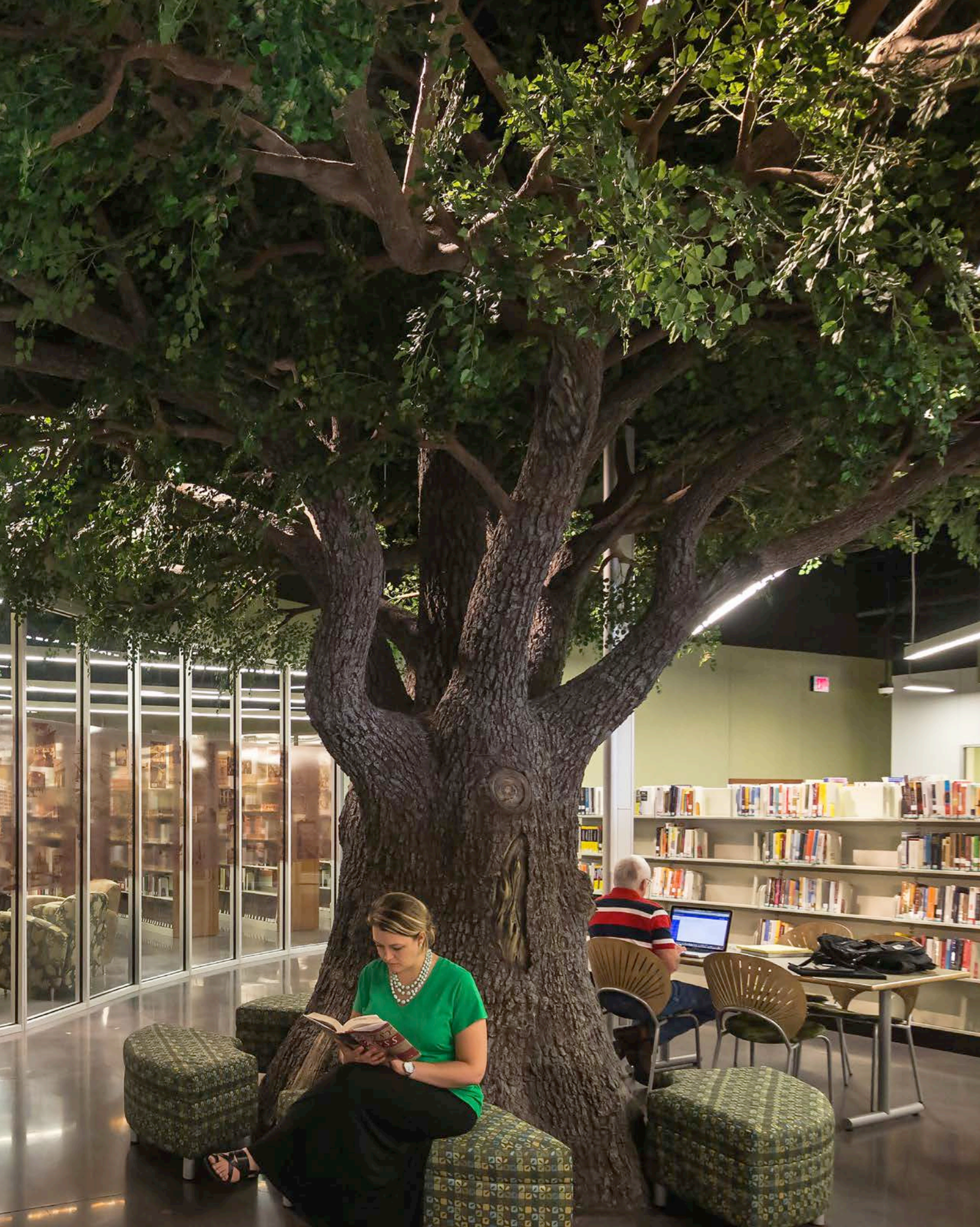
Sealment Tree for Library